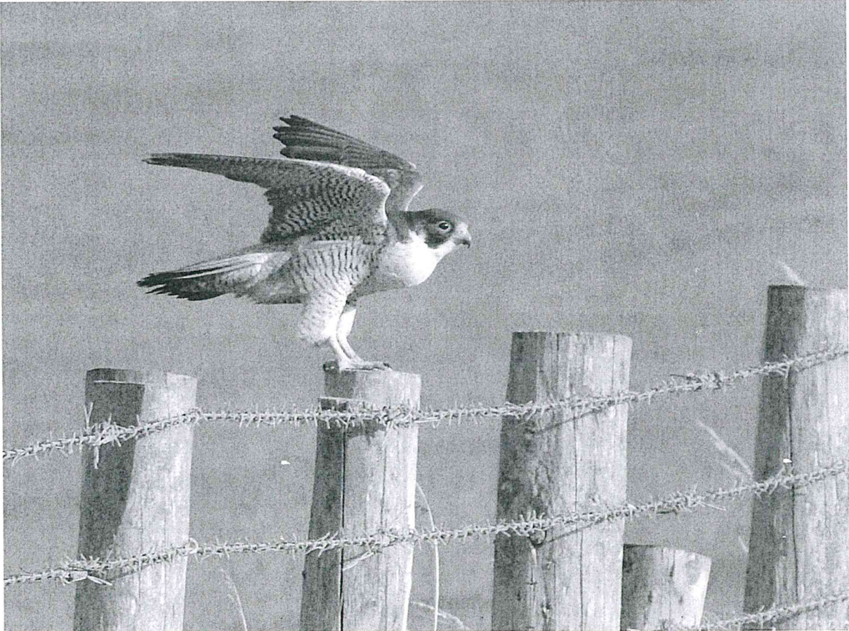
Cleared for landing – peregrine falcon