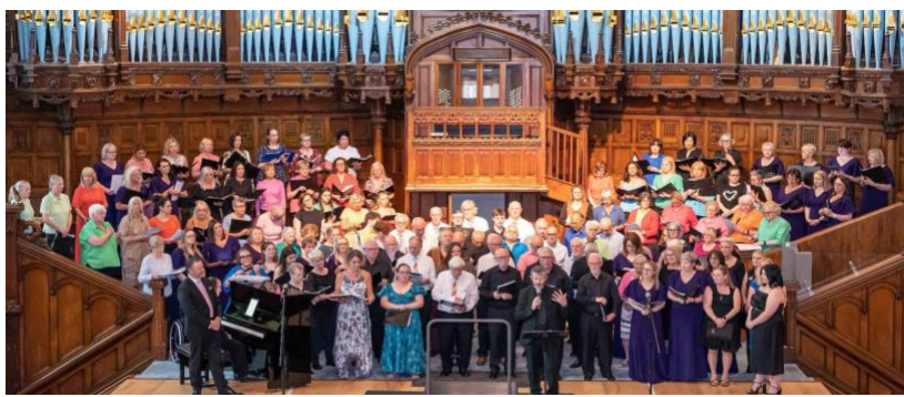
Every Voice Festival Gala Concert, June 2023

The annual Every Voice Festival took place from 11th to 18h June. It comprised 13 events including gala, youth & community concerts, pop-up performances and the delivery of 46 workshops. There were a total of 1197 participants and 18,147 audience members.