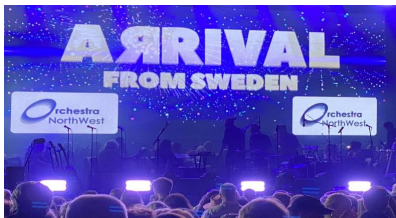
Orchestra NorthWest performing with Arrival from Sweden, Ebrington Square, August 2023