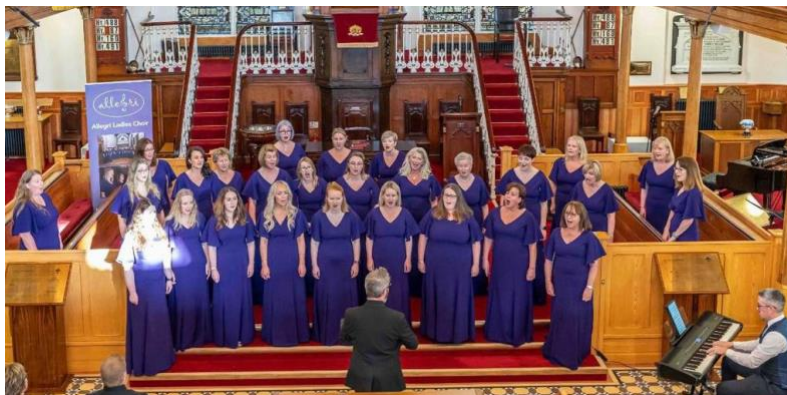
Allegrī Ladies Choir perform in the First Derry Presbyterian Church in June 2023

Allegrī Ladies Choir started their year with a wonderful collaboration with an acrobatic troupe from France Compagnie XY in St. Columb's Park on a beautifully sunny day in August. They took part in the Christmas event in the Guildhall, Derry in December. In February they were invited by Kiamsha Youth Empowerment Organization to record a rendition of 'Lift Every Voice and Sing' in collaboration with a group of local Nigerian students in Derry to celebrate the 25th anniversary of the Good Friday Agreement. On 1st June they hosted and performed in concert with Baylor University Bella Voce Young Women's Choir from Texas, US.