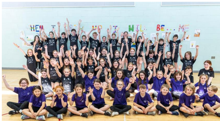
Allegrī Junior and Youth Choirs at their summer scheme, August 2023

During the year Allegrī Junior and Youth Choirs took part in two sold-out performances of 'Shirah of Bethlehem' in The Playhouse, Derry. They collaborated with St Louis' Children's Choir, Guildhall, Derry. In August they took part in two successful weeks of summer workshops with two showcases for 75 young people.