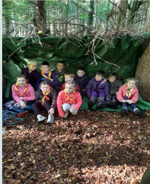
Friday Beavers Gosford oct 22