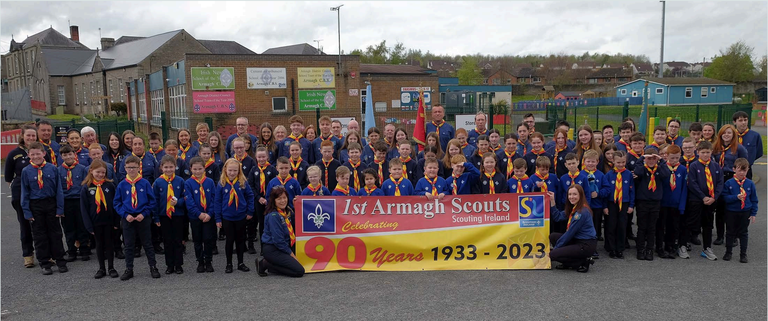
1 st Armagh Scouts 105996