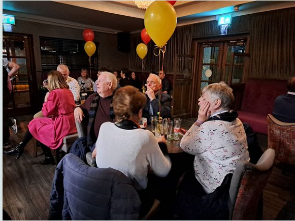
90th year celebrations Quiz Night