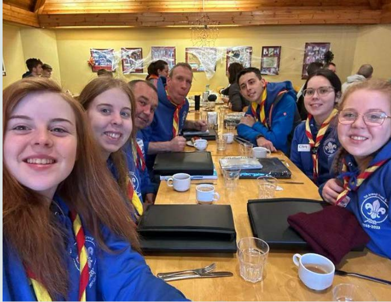
Leader Training Oct 22