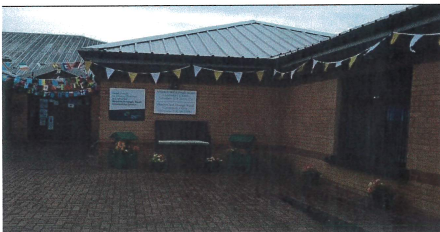
Meadow / Armagh Road Community Centre