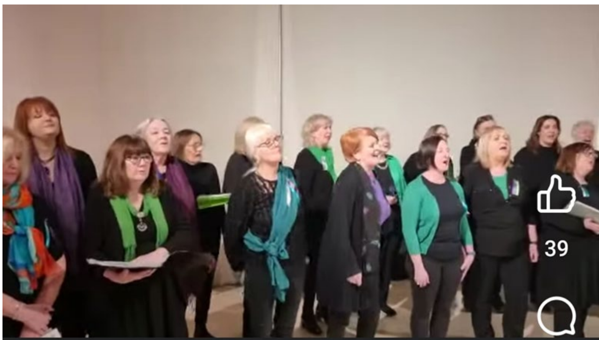
Performing at 2 Royal Avenue as part of Féile an Phobal's International Women's Day Celebrations