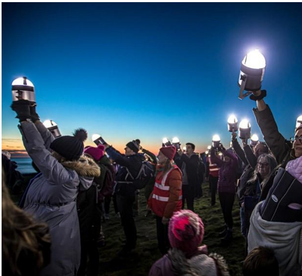
'Darkness into light' Summer Solstice was welcomed by a group of Féile singers along with members of other choirs throughout Belfast to celebrate with one another and with one voice.