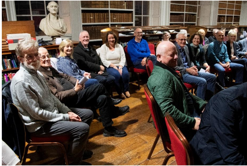
Part of the audience awaiting the poetry reading for National Poetry Day.

The Trustees of the City Chapter have met virtually to plan events for the coming year.