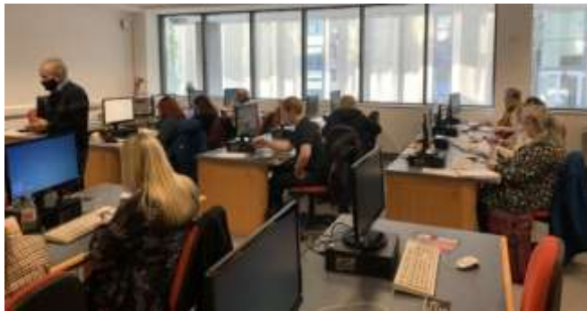
Form Students in class