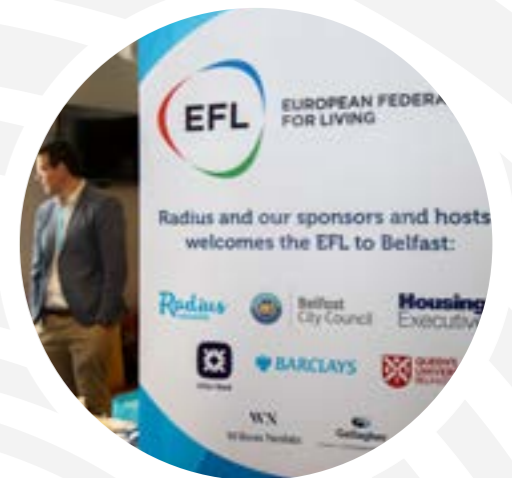
The Conference, hosted by Radius, was well supported by our stakeholders and sponsors

The event was an overwhelming success with many attendees, being impressed by Belfast and our rich social housing legacy, took away new insights and ideas to develop further in their own spheres of work.