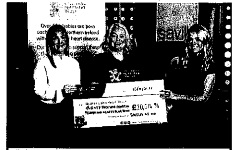
Savills present CHT with £20,014 raised from their Loco Bingo Night.

Danske Bank granted us £4,467.14 to purchase two Ambulatory Cardiac Monitors.