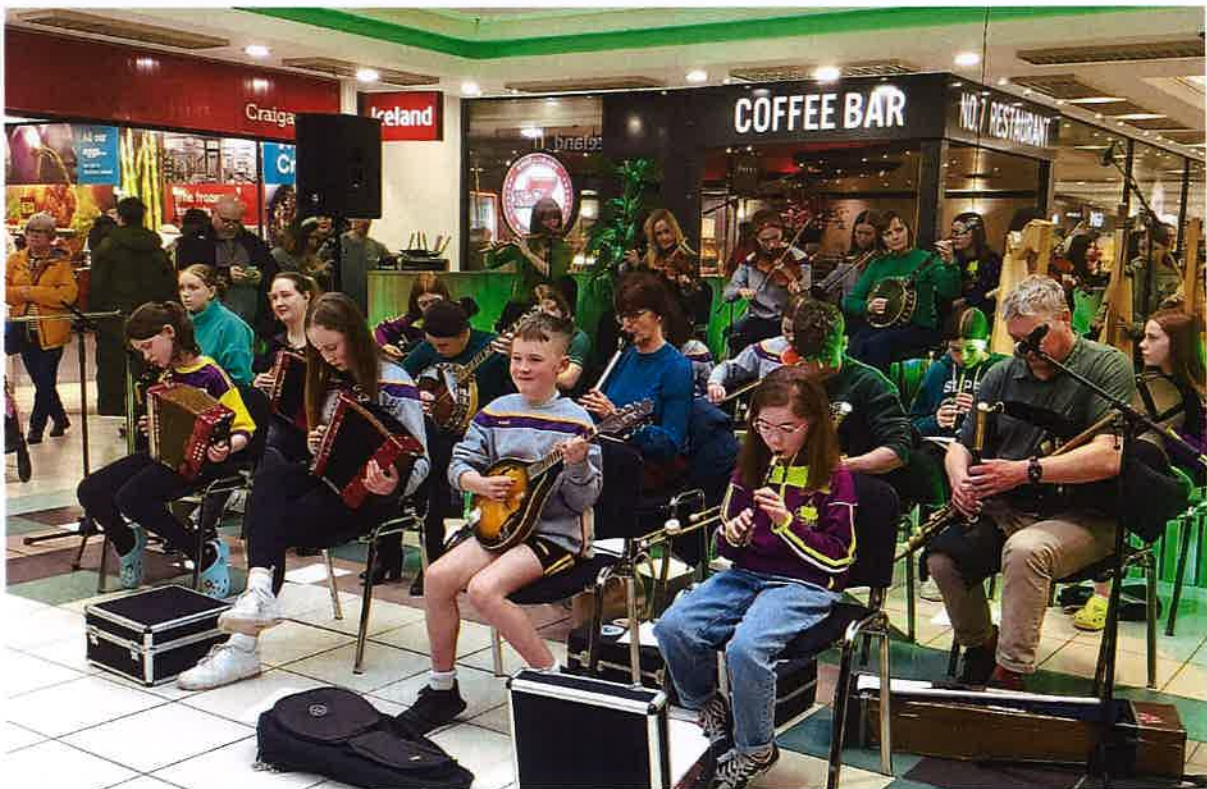
St Patrick's Performance - Mar. 2024 in Rushmere Centre.

Younger musicians were also involved in assisting tutors at FastTrad classes; some did this through their school schemes i.e. Duke of Edinburgh & Gaisce.