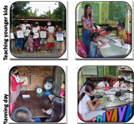
Teaching younger kids