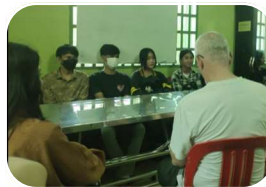
Learning with native English speaker