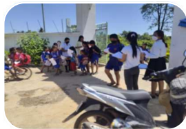
Handing out leaflet to encourage new students to come to CYC