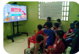
New learning resource & technique