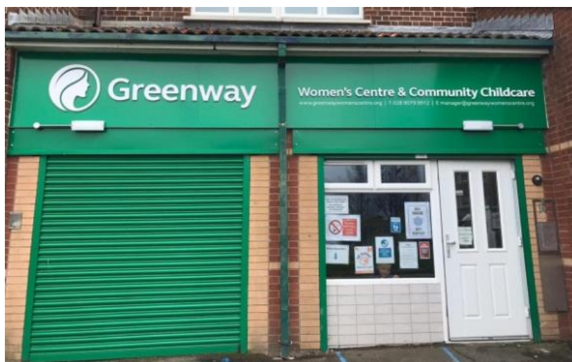
Greenway Women's Centre

Telephone Number: 028 9079 9912 Website: www.greenwaywomenscentre.org