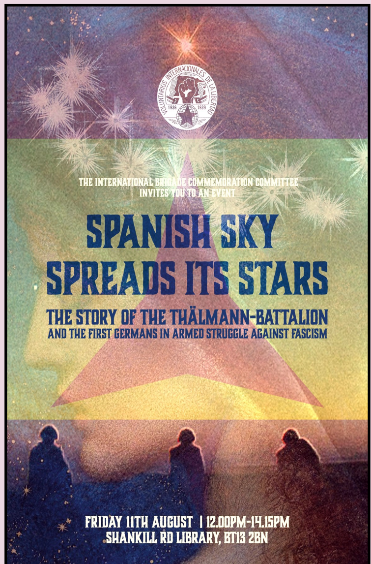
Poster made for the Feile event in August 2023