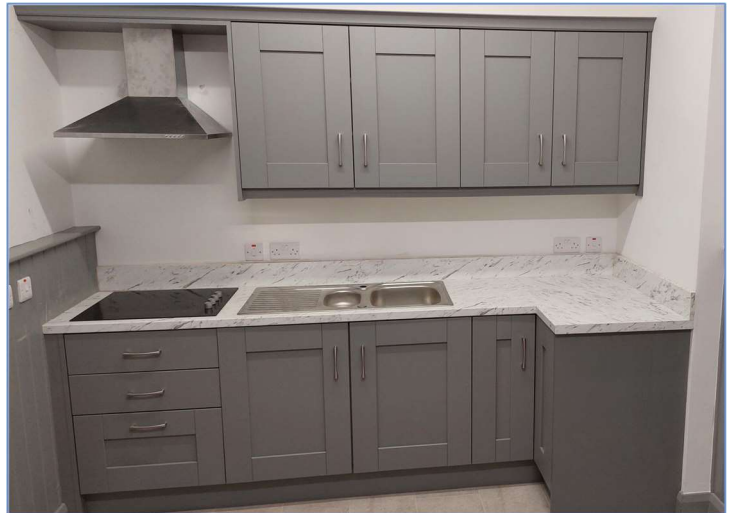
Successful projects from the Wind Farm Community Benefit Funds