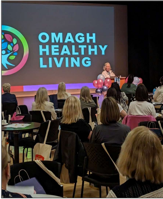
Living with Menopause Information Session

Wellbeing commenced in Dromore in March 2024, in conjunction with Dromore & Trillick GP Practice, as did Smoking Cessation in Fintona on 13th March. During the year we identified areas of health inequalities and need and have addressed them when possible. For example the very successful event we held based around Living with Menopause and the follow-on programme 'Your Time To Thrive'. We were asked to be involved in helping to develop a Traveller led Omagh Traveller group in conjunction with FODC and the Western Trust.