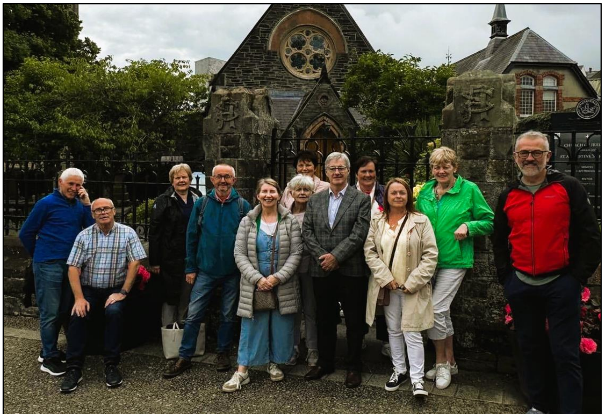
Directors and staff visit Derry/Londonderry