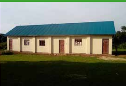
The three class-roomed teaching block

During the year when restrictions allowed, ongoing activities at D.C. continued with some residential