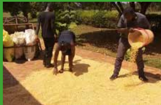
Maize harvest drying in the sun.