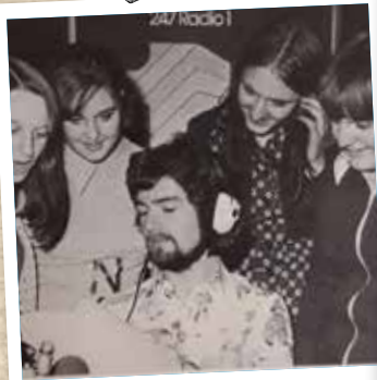
Noel Edmonds visiting Hereward Wake House in Dec 1972