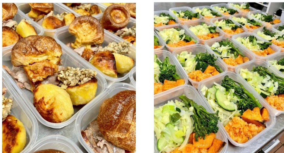
Sunday lunch for our Meal Delivery Service Customers.

Our Christmas Lunch did not take place in December 2021 but we are pleased to report we did do it in December 2022 and there will be more about it in next year's annual report.