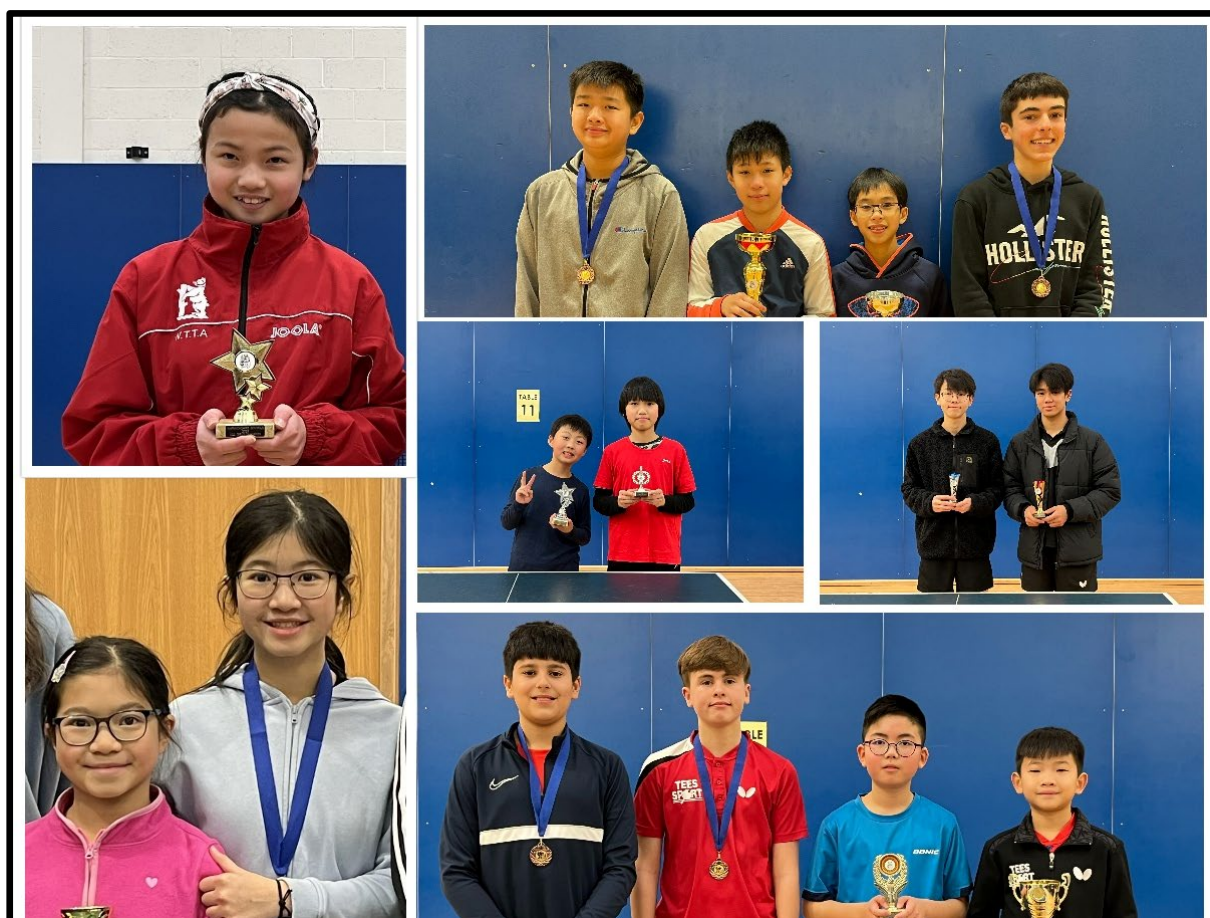
Above: Warwickshire Individual Schools winners.