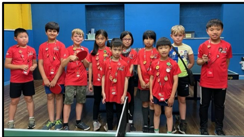
Above: TT Kidz group.

The TT Kidz Award sessions continue to thrive, with new under 11 players being introduced to the sport in a fun and enjoyable learning environment. The girls' only coaching session has continued on a weekly basis, helping to increase the number of female numbers to our highest in the history of the club. Both these sessions have been financially supported by the Heart of England Community Foundation – Solihull Voluntary Sector Resilience Fund following a grant of £2001.