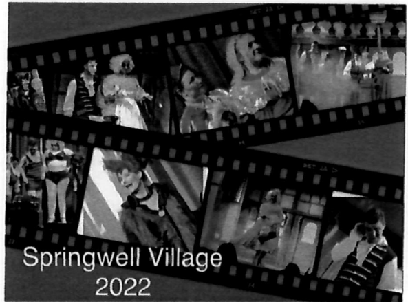
Springwell Village 2022

I am pleased to say that I have received enquiries from some potential 'stars' wishing to join our group and I look forward to the start of rehearsals in September and seeing what the group can do with the next script. The production team are meeting at present to choose a suitable script and an announcement of the choice will be made very soon – watch this space!