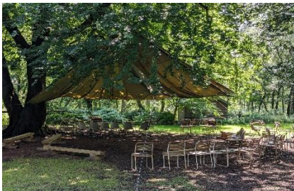
Benches in the Dome