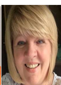
TRUSTEE (Became CHAIR Sept 22)