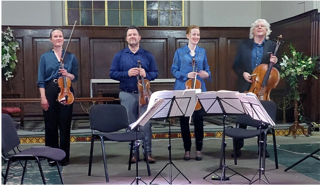
The Dante String Quartet, who opened the season in September at St Alkmund's Church