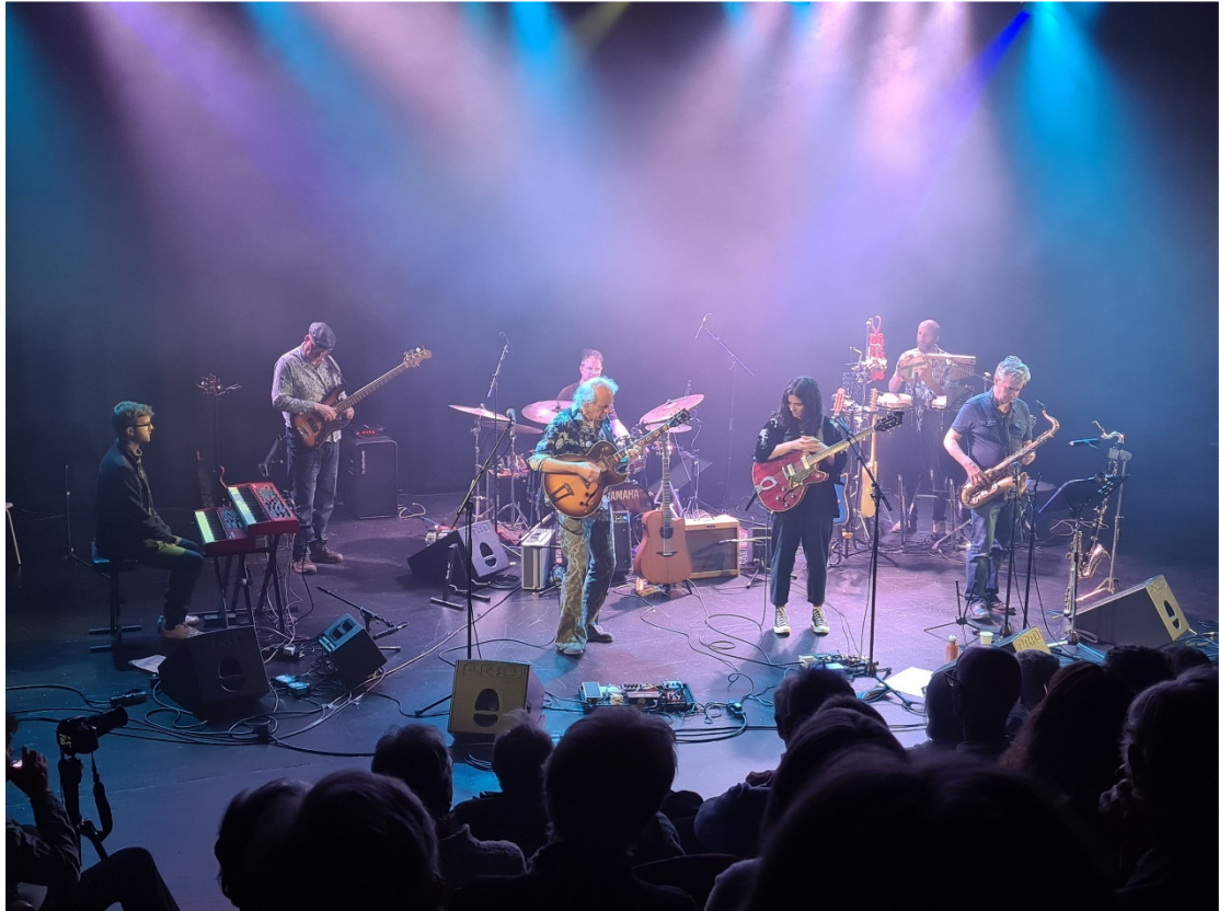
Hejira performing at Shrewsbury School's Barnes Theatre

Our other jazz concert followed in May when clarinettist Julian Bliss returned with his own jazz band to perform music by Gershwin, Benny Goodman, and from the great American musicals.