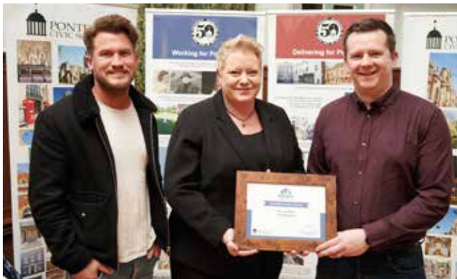
Regeneration Award - The Last Bank