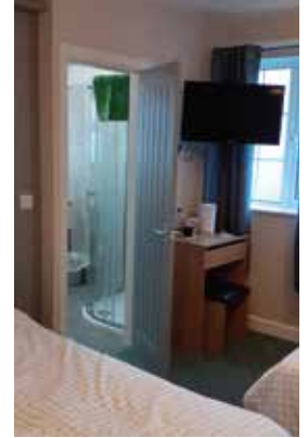
Residential Award - 4 Mill Hill Road Hitch & Midgley builders