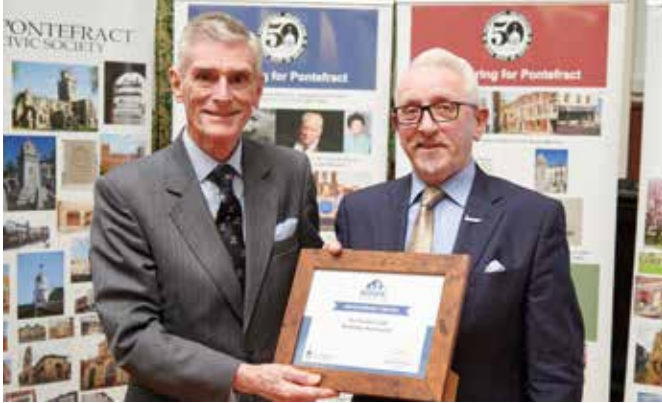
Improvement Award - The Pavilion Café, Pontefract Racecourse