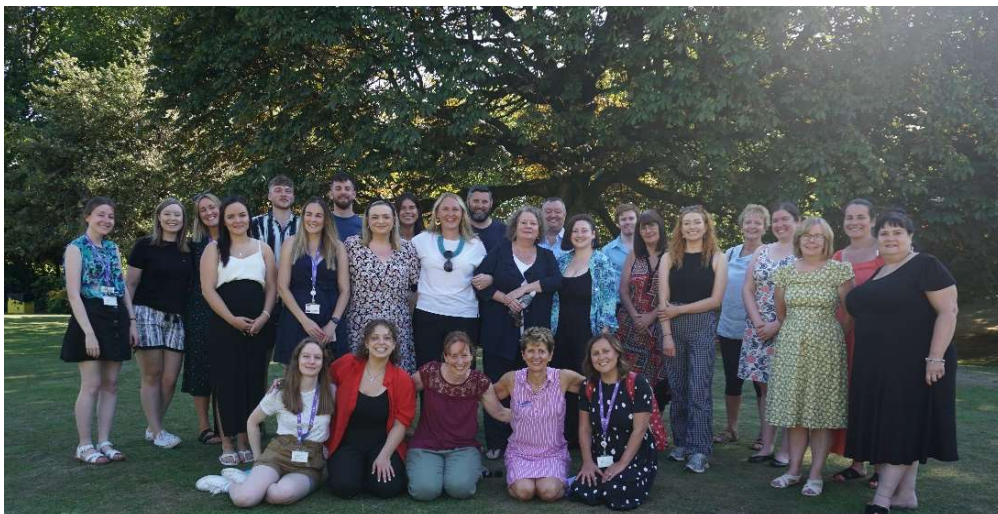
Picture: All staff meeting, enjoying the sunshine

This was delivered alongside; regular weekly communications, wellbeing walks and other initiatives headed up by our Wellbeing Working Group to support staff and ensure they felt truly connected to our purpose and goals.