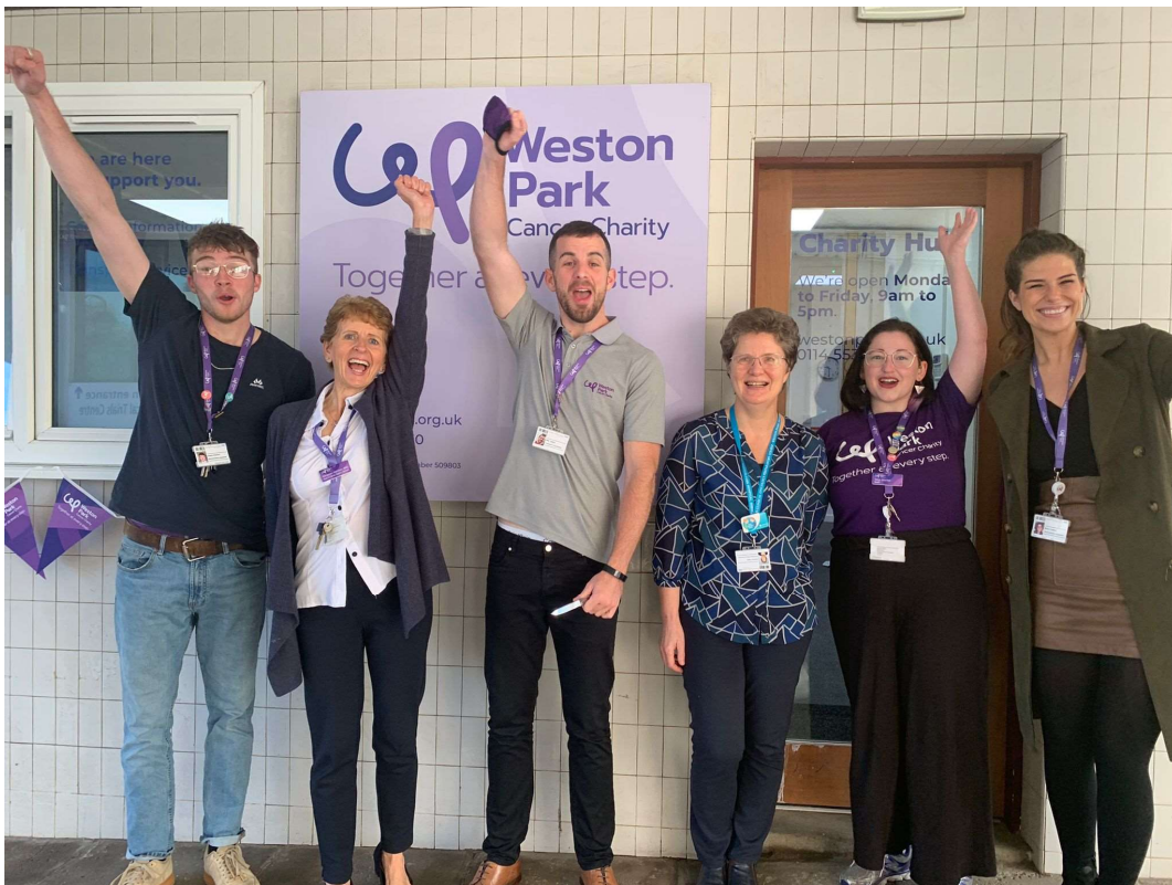
Picture: Staff and trustees celebrate the opening of the charity hub

“The Charity Hub is such a breath of fresh air after spending time in the hospital environment. The staff there are SO helpful and caring, and there always seems to be a supply of tea, coffee and biscuits, all set in a very comfortable and relaxing environment.” Anonymous feedback from someone visiting the hub, whilst undergoing cancer treatment