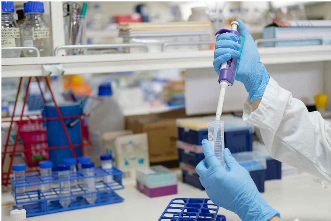
Picture: Research staff return to the labs

We were also proud to provide £254,000 of funding for clinical trials at the Cancer Clinical Trials Centre at Weston Park. In the last year, 172 clinical trials have taken place which have allowed 1,272 people to take part in ground-breaking research. For some people, the opportunity to participate in a clinical trial could be a life-saving opportunity for someone who is out of options, when standard care cannot do any more.