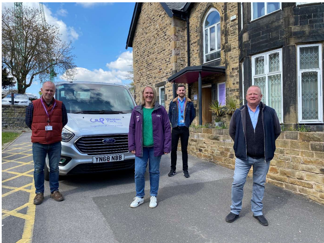
Picture: Volunteer drivers and charity staff get the new transport service up and running

You and the drivers have been brilliant and have delivered over and above the service we ever anticipated.” Anonymous feedback received from someone using the transport service