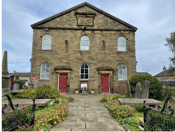
West Lane Baptist Church Haworth BD22 8EN