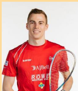
Nick Matthew OBE