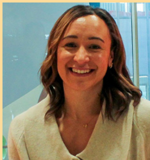
Dame Jessica Ennis-Hill