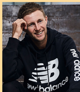
Joe Root MBE