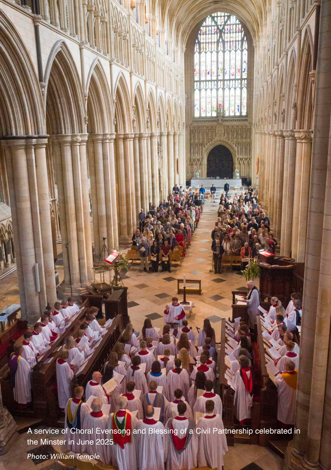
A service of Choral Evensong and Blessing of a Civil Partnership celebrated in the Minster in June 2025.