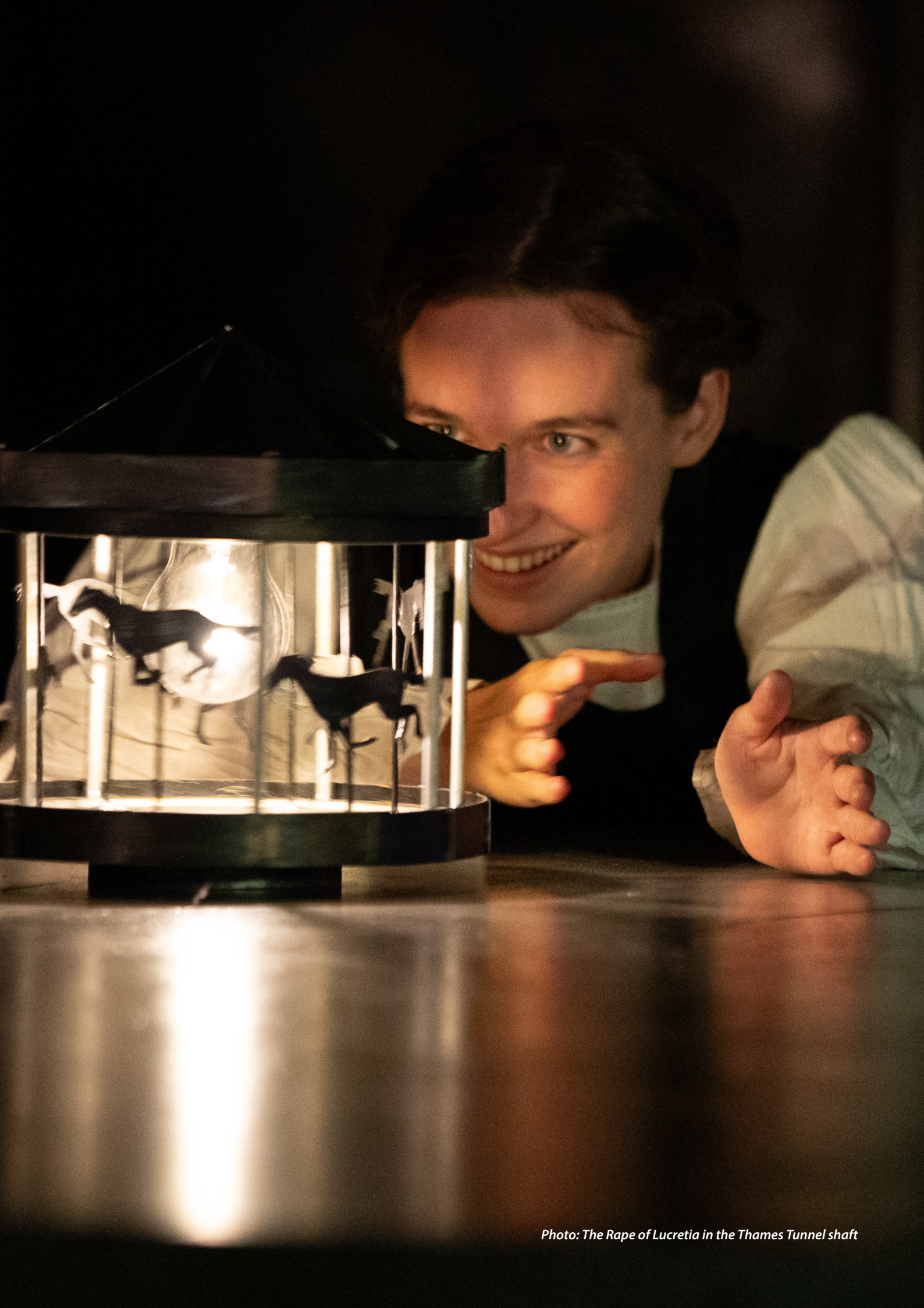
Photo: The Rape of Lucretia in the Thames Tunnel shaft