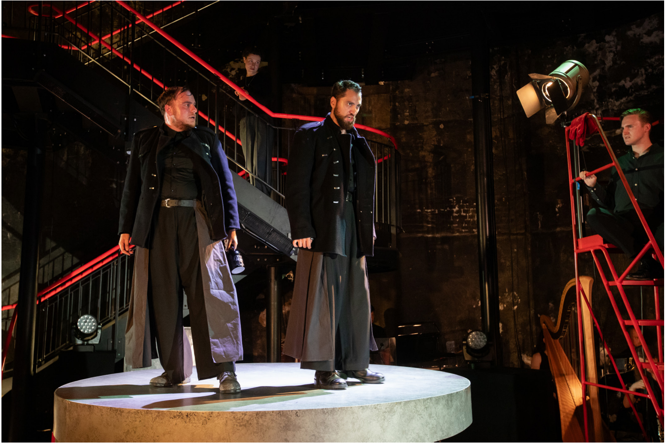
Photo: The Rape of Lucretia in the Thames Tunnel shaft

In August 2024, BYO presented Benjamin Britten's chamber opera The Rape of Lucretia delivering a powerful and contemporary interpretation that resonated deeply with audiences and critics alike. The production was staged from August 12 to 15 2024, in the historic Thames Tunnel Shaft in Rotherhithe, London. This subterranean venue provided an intimate and atmospheric setting that enhanced the opera's intense narrative. The production received critical acclaim, with The Guardian awarding it four stars, describing the experience as "physically shattering" and commending the production's contemporary relevance.