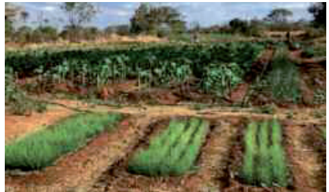
The school farm at Inyathi High School.

For the full report, see: http://www.radisol-client.co.uk/education-charity-zimbabwe/downloads/annual-report-min.pdf