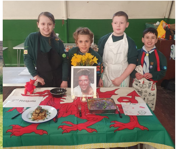
District Cooking Competition (above) Allotment work (left) Bower Hill Farm (below)