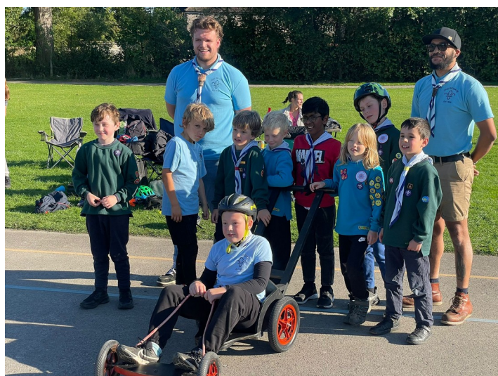
District Go Kart Competition