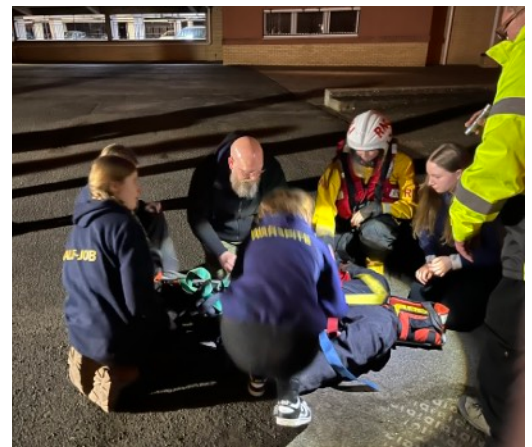
Explorer Scouts learning skills and teamwork raining with the RNLI

Two key principles demonstrating that Scouting's aims are for the public benefit are that through the Scout method young people develop toward their full potential and that there is a clear link between the benefits for young people and the purpose of Scouting. The safety of young people is taken very seriously and the benefits Scouting activities provide far outweigh the risks. Any private benefits from Scouting are incidental, other than those as a beneficiary.