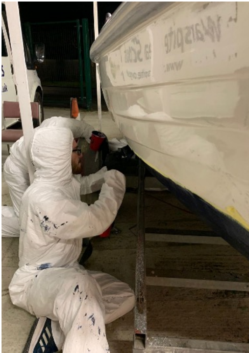
Left: Explorers working on boat maintenance.