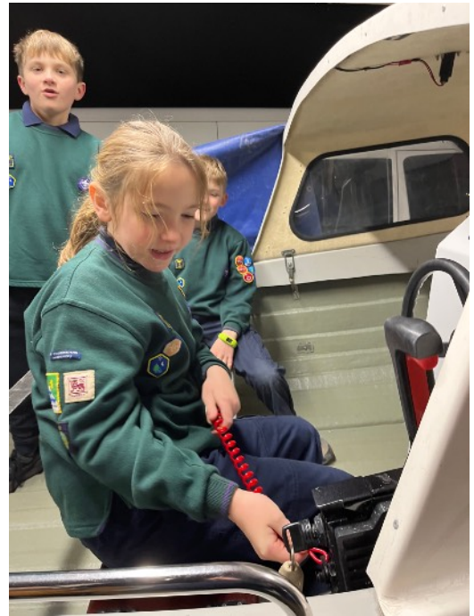
Right: Cubs being introduced to boat safety.