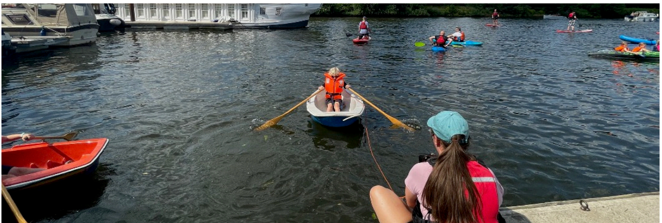
Bottom: Beavers learning to row.