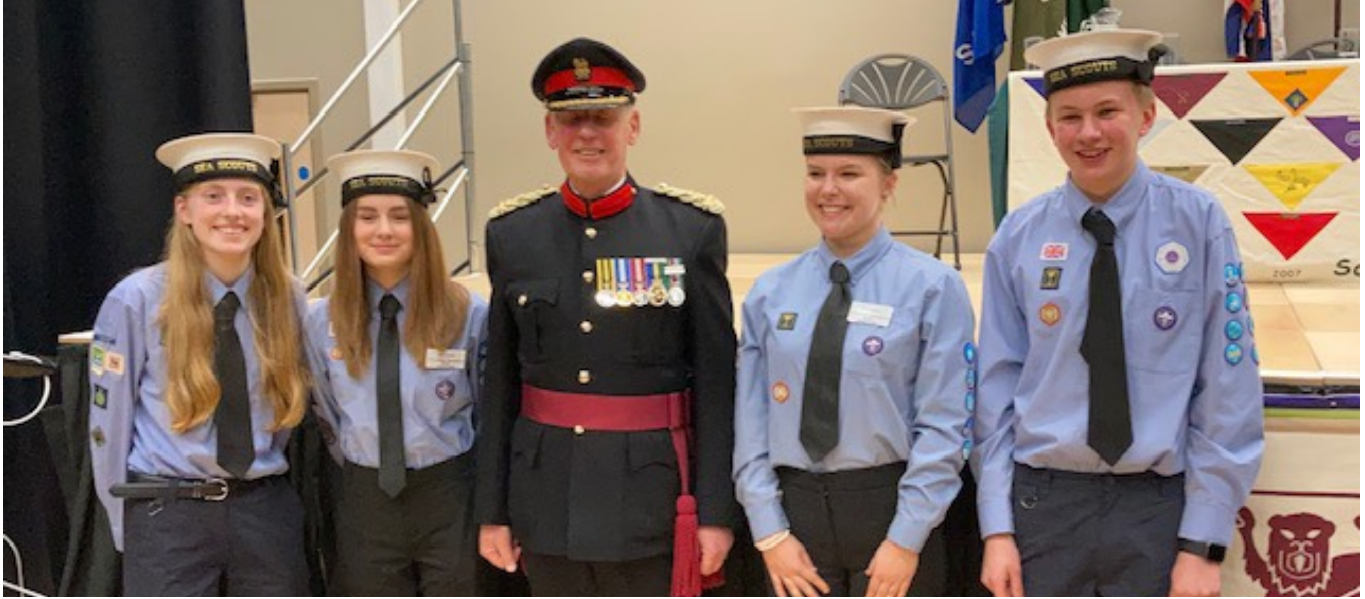
Top: Chief Scout Gold awardees at County Presentation.