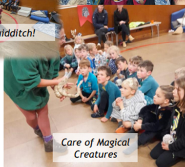
Care of Magical Creatures