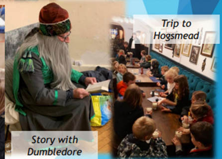
Trip to Hogsmead