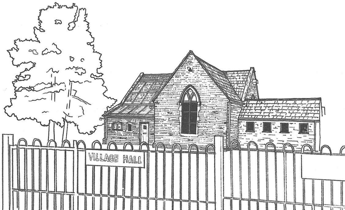
The Village Hall, Barton St David