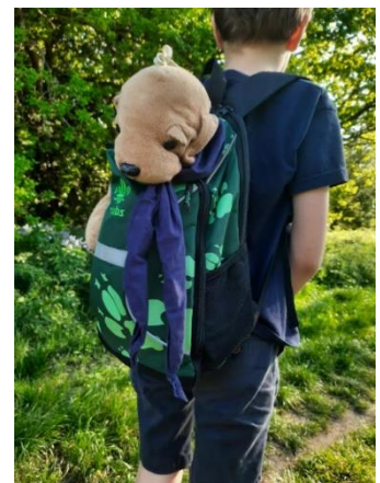
Fundraising by selling Cordial & Hike to the Moon