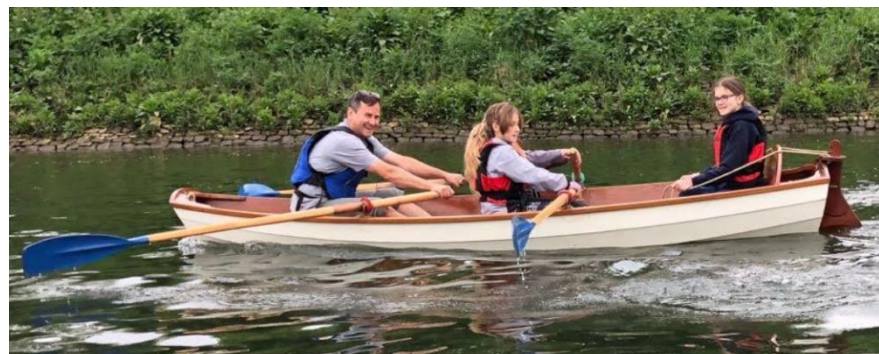
Boating on the River Thames