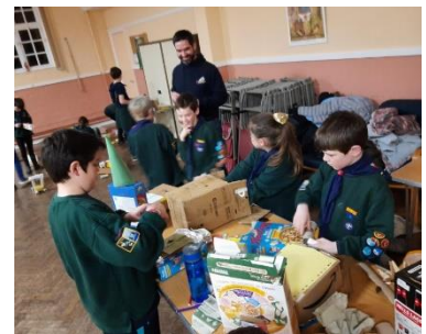
Sea Hawks Cubs making models at St Thomas Aquinas Church Hall, March 2020