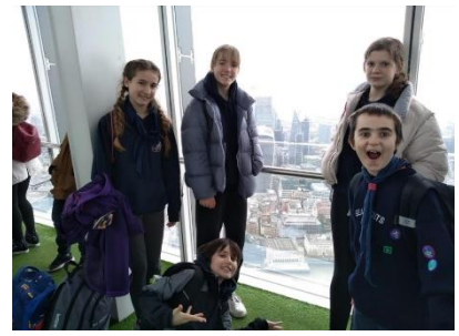
Phoenix III Troop at Monopoly Run