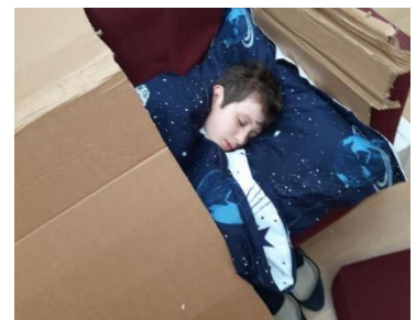
Cardboard Camp (part of our Scout@Home programme)