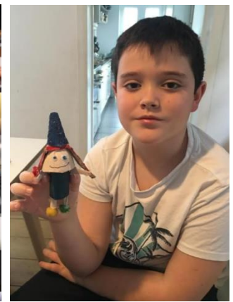
Thank You NHS, the things Leaders do to entertain, Crafts