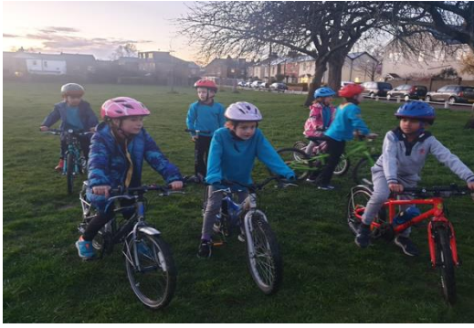
Nothing beats 'mud on the wheels' kind of fun