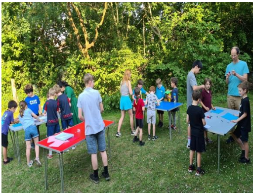
Painting with Magnets