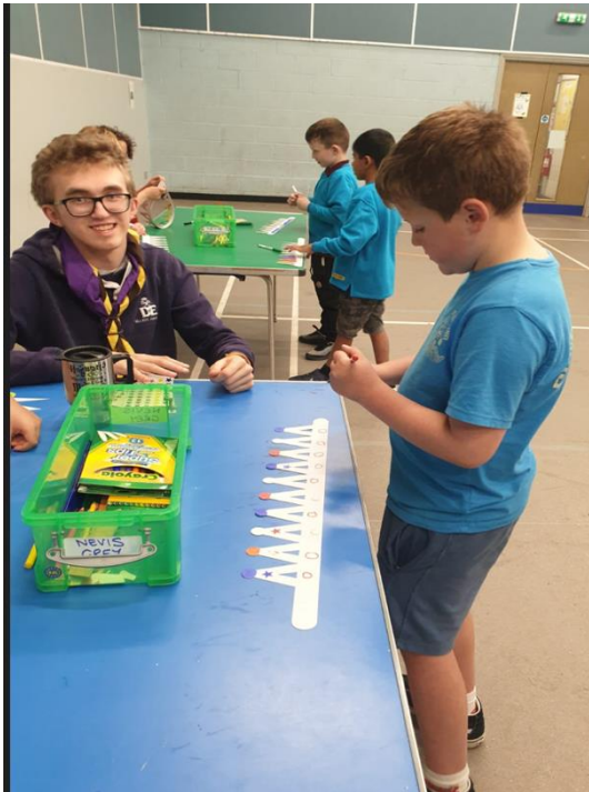
Coronation themed activities