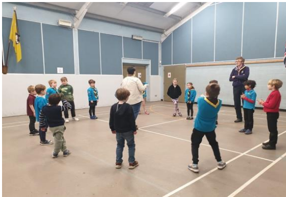
A game of splat!