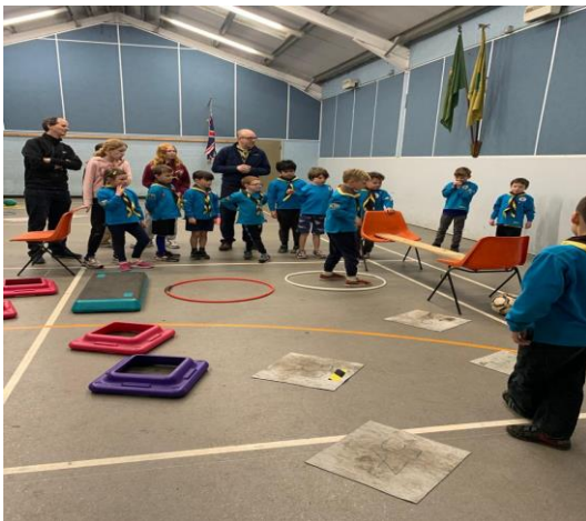
Great teamwork with an obstacle course