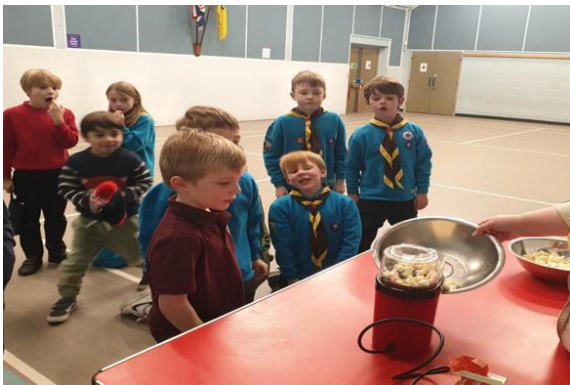
Making popcorn with friends is fun