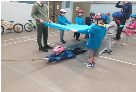
Goodbye Beavers and swim to Cubs!!!