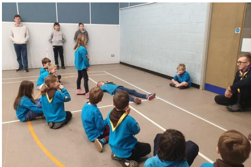
Learning about emergency aids and the recovery position