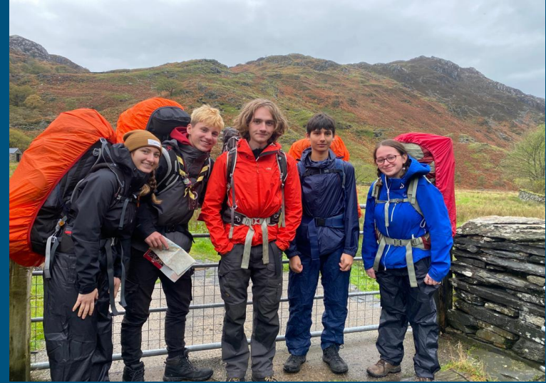
Silver and Gold Duke of Edinburgh Awards