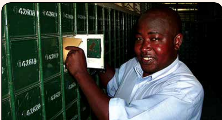
Overseas papers being collected.

Number of workers: 252 (237 in UK; 15 overseas).