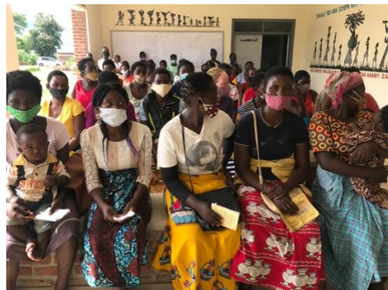
Busy Antenatal clinic