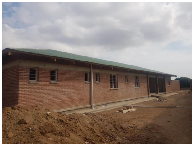
View of Maternity Clinic

Following the outbreak of the global Covid-19 pandemic, AMECA left Malawi for the UK during the 3 rd week of March, as a result of closing borders and the rapid spread of the Covid virus. Liaison has continued via email and telephone, during our absence and AMECA has also remained in regular contact with the primary healthcare staff on site and with the Blantyre District Health Office, in order to monitor progress.