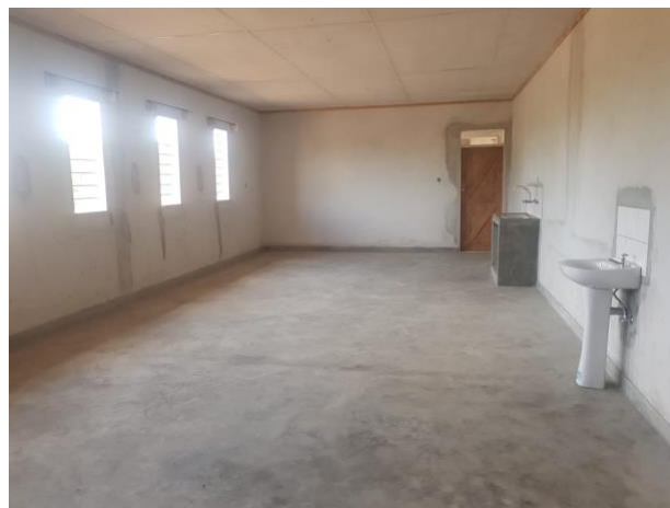
Post Natal Ward