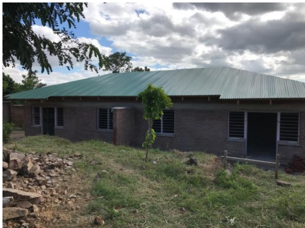
One of the duplexes, comprising 2 staff houses

Concurrent to the building of the maternity clinic, the staff accommodation and supporting infrastructure was also constructed, including the septic tanks, ablution block and laundry area. By the second week of March, brickwork had been pointed, the septic tank for the staff accommodation was near completion and the plumbing was in place.