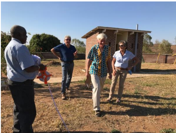
Contractor, architect and AMECA on site

In September 2019, construction work began to build a high-quality maternity unit to provide mothers with an accessible facility in which to safely deliver their babies, together with staff housing to ensure that key senior staff is available on site at all times.