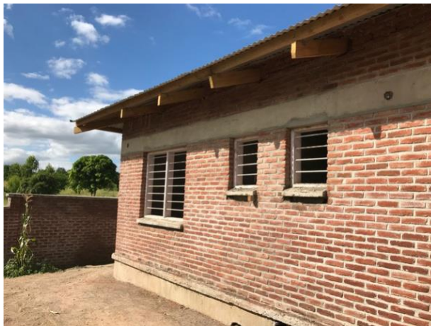
Detail on brickwork pointing