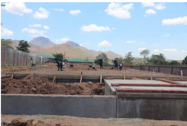
Maternity clinic foundations in October 2019

During October, the foundations were laid, the foundation brick walls were constructed and plastered on the outside to prevent damp, which is especially important during the rainy season and also prevents the entry of termites. During December 2019 and January 2020, the roofing trusses were anchored to the building using steel ties.