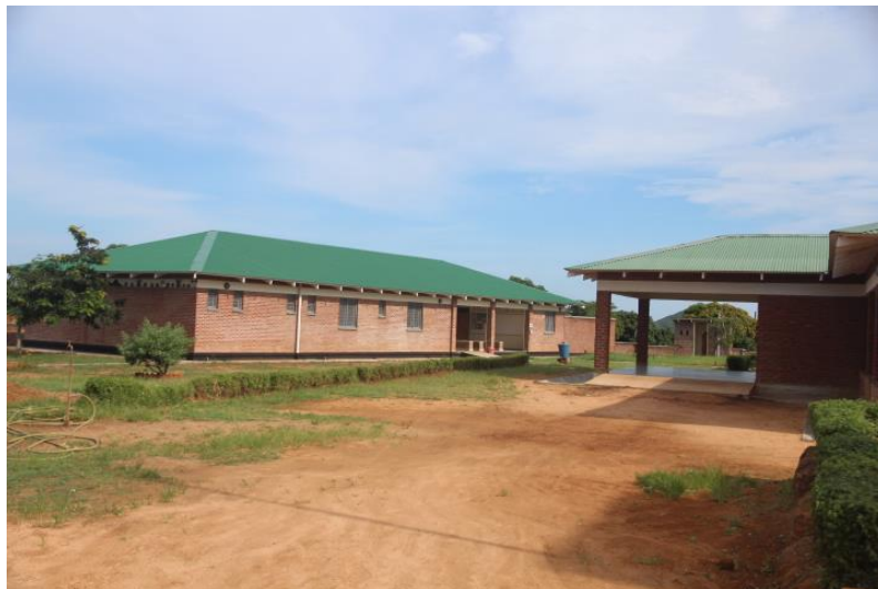
View of new maternity clinic and existing primary healthcare clinic

AMECA will present a detailed report on the maternity clinic and staff mentorship initiative in the next Annual Report.