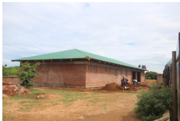
Clinic roofing in January 2020

During February 2020, the internal walls were plastered after the electrical conduit had been placed in all rooms. Liaison took place with the contractor regarding clarification on the siting of medical equipment and furnishings within the maternity clinic. This is an important detail to ensure that electrical connections and plugs are both adequate and correctly positioned, within the delivery suite, wards and offices.