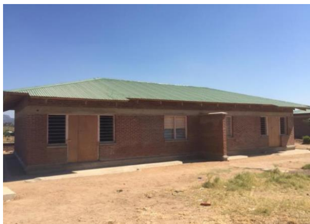
Front views of Duplex housing June 2020