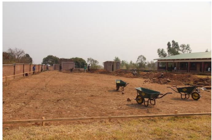
The cleared site ready for the start of construction

During October, the foundations were laid, the foundation brick walls were constructed and plastered on the outside to prevent damp, which is especially important during the rainy season and also prevents the entry of termites. During December 2019 and January 2020, the roofing trusses were anchored to the building using steel ties.