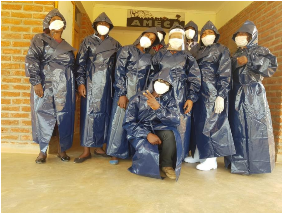
Clinic staff with their donated PPE

In response to a request from the Blantyre District Health Office, AMECA made a donation of N-95 masks, disposable aprons and full body coveralls to assist with the severe shortage of PPE in Malawi for its healthcare staff. AMECA was assisted with funding for the PPE from The Rotary Club of Epsom. 10,000 disposable aprons, 100 washable coverall suits and 175 N-95 masks were donated and distributed to clinics through Blantyre district.