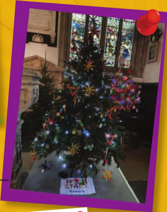
The children decorated the Christmas Tree for the Festival at St Magdalene Church in Newark.