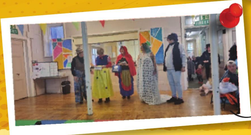
Staff and Volunteer's put on a panto for family group.