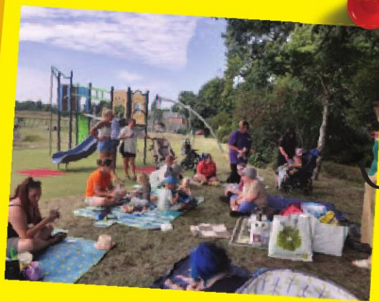
Teddy Bear picnic at Sconce Park