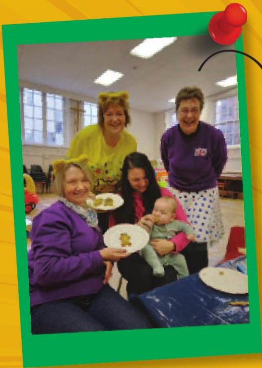
Celebrating Children in Need with families.