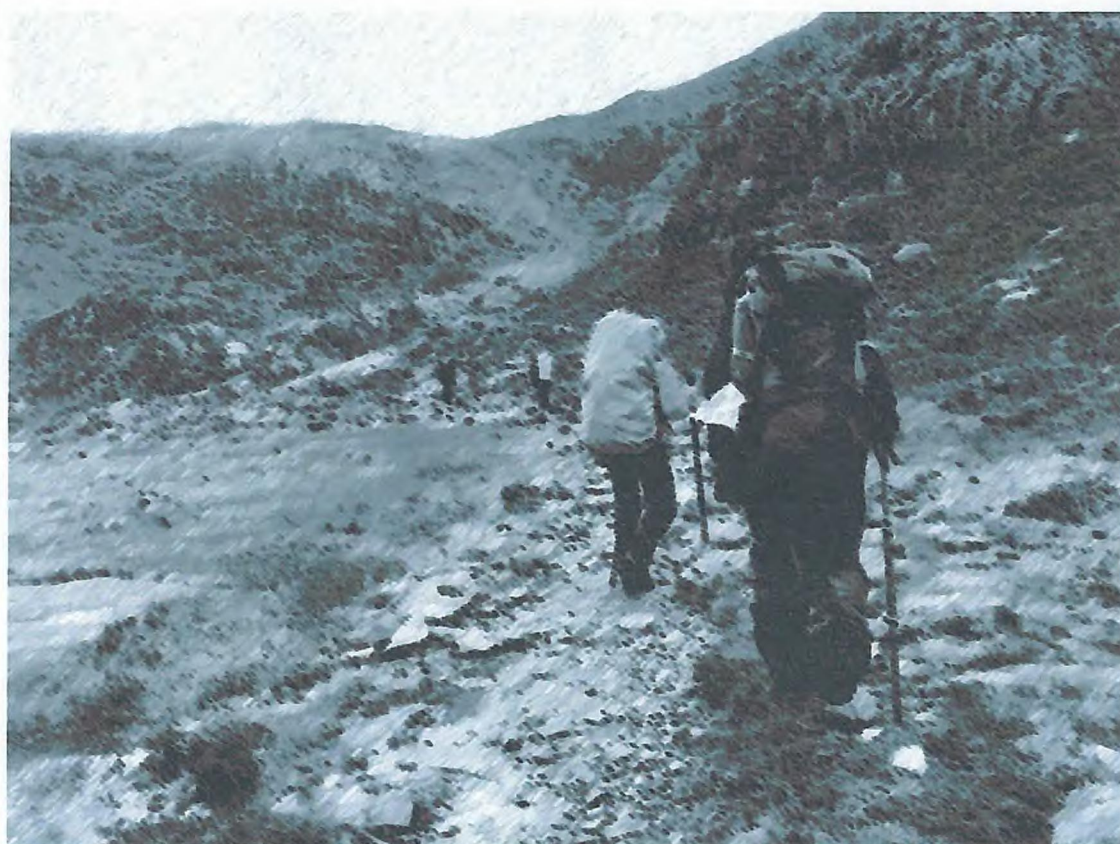
Duke of Edinburgh Gold Award students trekking in the Lake District

Charity Registration Number 1108984 (England and Wales)