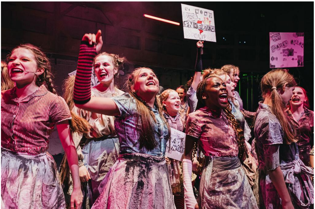
When We Strike, Southwark Playhouse, August 2024

BYMT complies with all statutory required policies; these can be reviewed on the BYMT website www.britishyouthmusictheatre.org