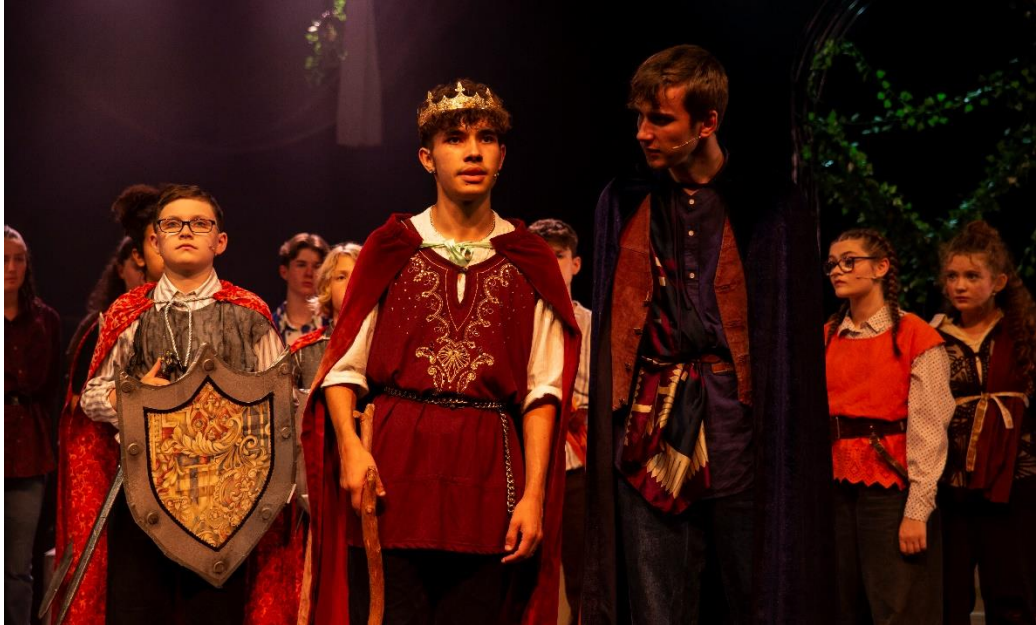
The Power of Camelot, Exeter Northcott Theatre, August 2024