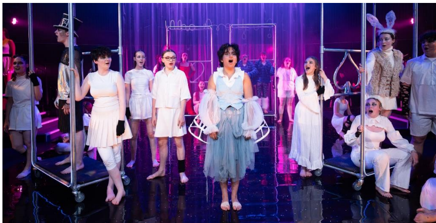
Wonderland in Alice, Octagon Bolton, August 2024

With our additional thanks to all schools, colleges, companies, local organisations and individuals who have made donations to individual course fees or sponsored our young people.