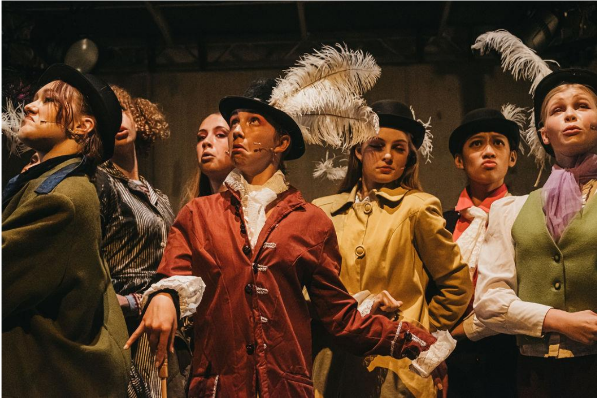
When We Strike , Southwark Playhouse, August 2024

2024 marked 20 years of BYMT; to celebrate, the Company delivered seven new musical theatre productions and developed seven shows through camps, as well as creating a Youth Convention and a Gala, sharing BYMT's success to date.