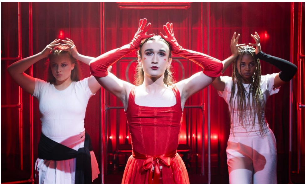
Wonderland in Alice, Octagon Bolton, August 2024

BYMT's Mission is to create opportunities for young people and early career creatives from all backgrounds to develop theatre skills and enhance wellbeing, through the collaborative and inclusive process of making original music theatre.