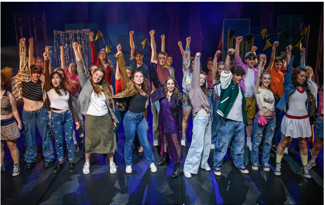
Unbound , Birmingham Hippodrome, August 2024

Looking forward, 2025 will be the year BYMT establishes partnerships and localized projects in West Yorkshire, as well as working with 25 writers to build a national programme of new musical theatre. BYMT will continue to strengthen its staff and Board through training, detailed discussion with the Young Company Panel and Artistic Associates, data-led decision-making and productive partnerships. We will ensure that the creative opportunities we deliver will be in the best interests of BYMT and the young people on our programmes and for the sustainability and success of new music theatre in this country.