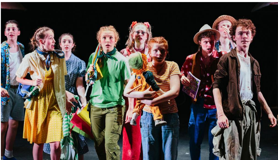
Welcome to Serene, The New Wolsey, Ipswich, August 2024

Corporate Donation: The Teaching Union NASUWT remained our principal supporter, with £30,000 as well as in kind support.