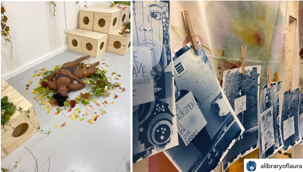
Life drawing with artist model Shareece Clayton and art activism workshop with young people aged 16 to 25.