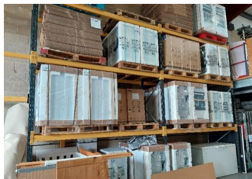
Supplies of Cookers, Fridges and Washing Machines ready for delivery

Since January 2021, we have also been running various government funded additional schemes. Firstly, the Winter Fund, then the COVID Local Support Grant and more recently the Household Support Fund. These funds have been able to help Southampton residents with Utility Top-up vouchers, Supermarket vouchers and some White Goods. All of this has placed extra pressure on the staff team and we are so thankful for their hard work and dedication. As the 2021 / 22 year ends we have been informed that the Household Support Fund has been given another round of funding, so we will continue to support local people in the months to come.