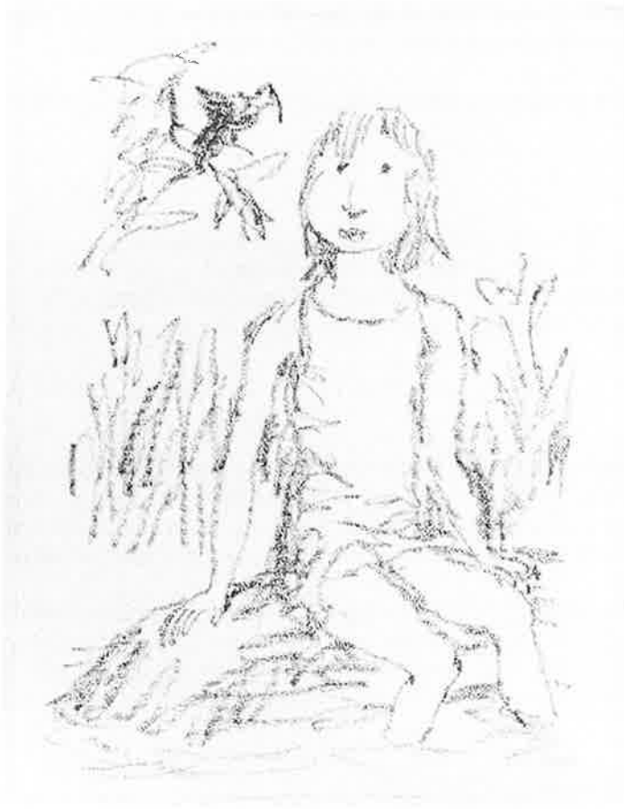
Sir Quentin Blake, 'Children with birds and dogs #3', 2019 © The Foundling Museum

Work will continue to improve the Museum's sustainability and energy-efficiency, including further lighting upgrades, disconnecting from gas, and renovating the under-pavement vaults, as well as maintaining and conserving the important heritage collections in our care, including our historic building.