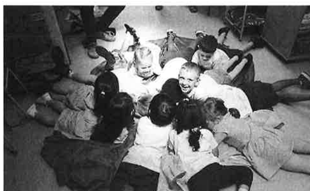
Children enjoying the Museum's exhibition, Quentin Blake: Gifted and early years' pupils taking part in an artist-led music and storytelling in their classroom.