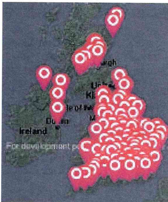
Locations of congregations in the UK and Ireland

The Salisbury Gospel Hall Trust congregation is one of the larger congregations in the UK, with 210 members living in the Salisbury area, however with residents from the Andover area and also from the surrounding areas of Bournemouth and Ferndown attending services up to twice a week, together with other visitors, numbers attending services regularly approach 650 persons, from young babies to the very aged.