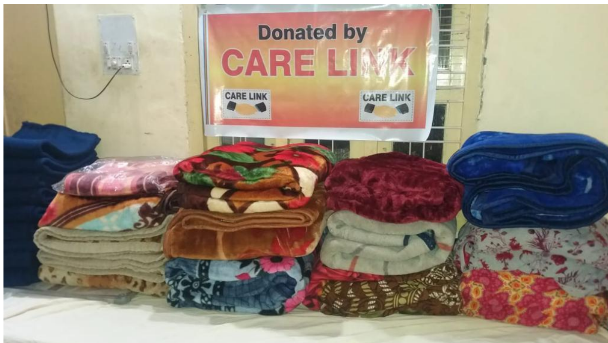
Figure 11: Blanket distribution among needy people

Sadaqah – a voluntary Islamic charitable deed (Donation) is a means of help to poor families. People who are financially well off, very often perform this Sadaqah (gift) which can be in form of money, clothing, animal sacrifice etc. On many occasions Care Link Trust receives requests for performing Sadaqah (in any kind) to benefit poor people and the arrangements are made as requested.