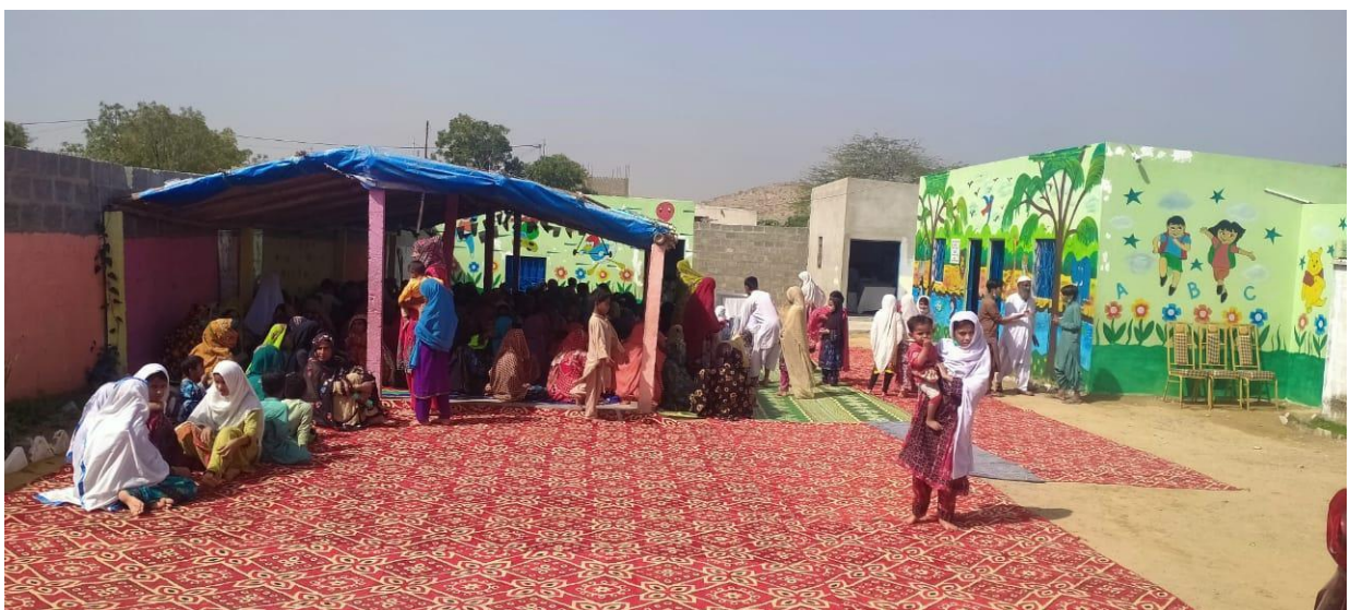
Figure 9: School Build by CARE-LINK in Balochistan, Pakistan