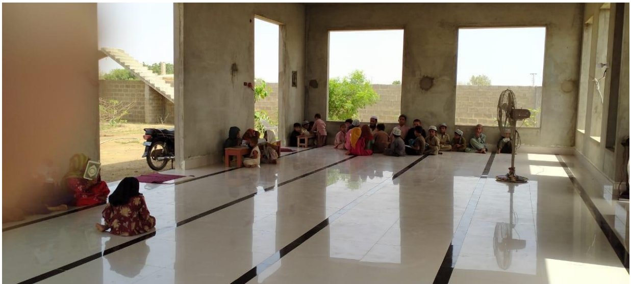
Figure16: Community welfare Centre