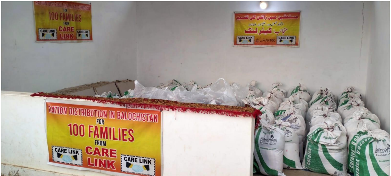
Figure 3: Food distribution to 100 families in Balochistan, Pakistan