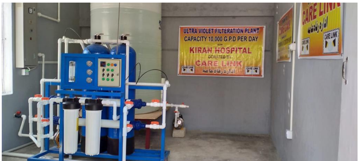
Figure 8: Water filtration Plant in Cancer Hospital Karachi