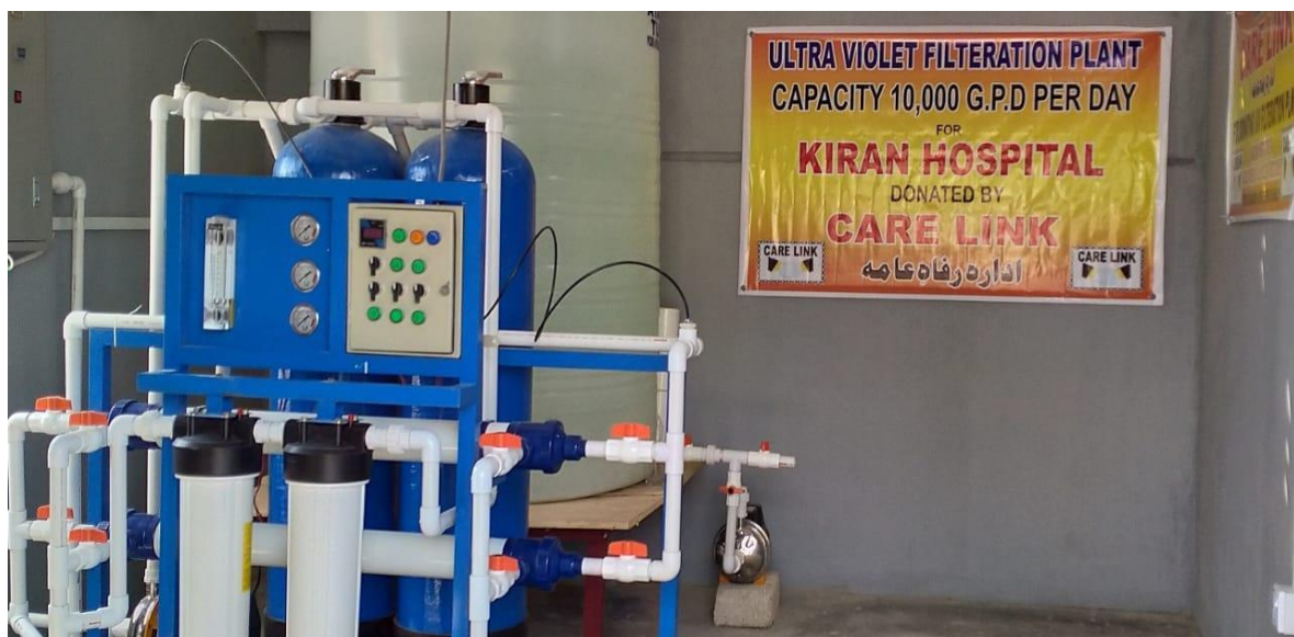
Figure 2: Filtration Plant was installed in Cancer Hospital to provide clean drinking water