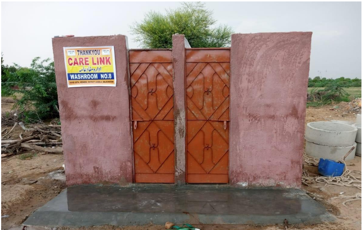
Figure 13: 12 Washrooms and toilets build for poor communities