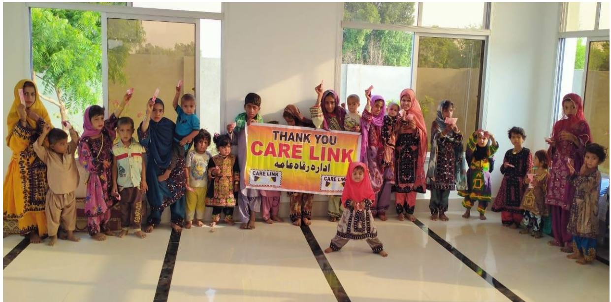
Figure 1: Cash was distributed to children to boost their confidence