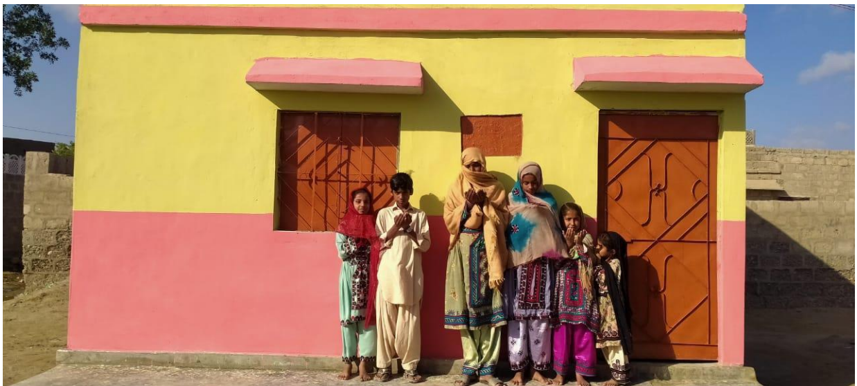
Figure 12: House build for poor family in Balochistan