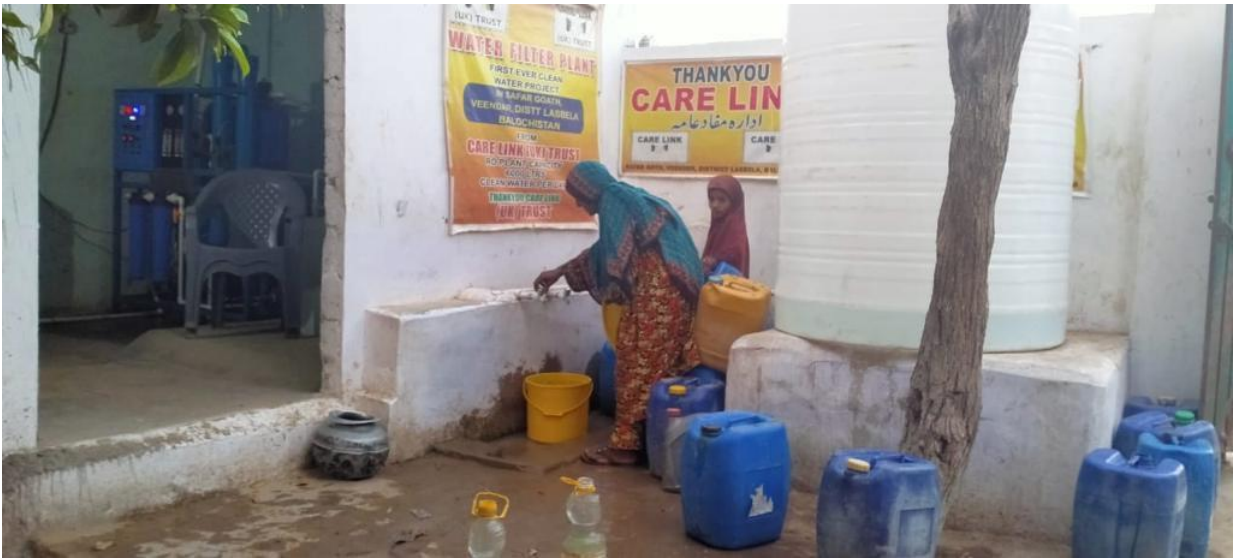
Figure 5: Water Filtration Plant in Balochistan, Pakistan