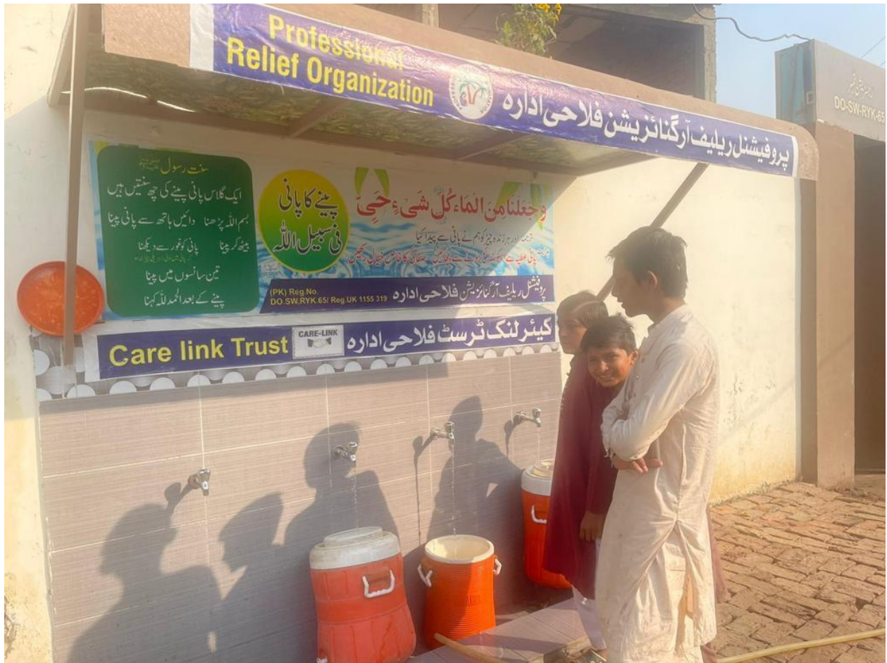
Figure 6: Water Filtration Plant in Khai Khair Shah Village Rahimyar Khan, Pakistan