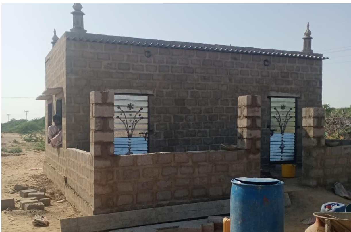
Figure 15: Community Welfare Centre Balochistan