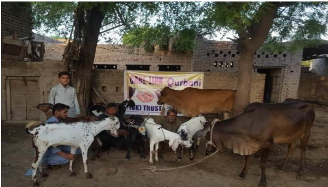
Figure 10: Qurbani 2021

In the month of Eid- ul- Adha, Muslims, who can afford, have an obligation to make sacrifice of an animal (per head). Although it is a religious obligation to sacrifice an animal, it provides a great opportunity to provide meat to those families who cannot afford to buy meat from open market. Many people donated to Care-Link (UK) Trust for their Qurbani animals (ritual animal sacrifice). Therefore, many of animals were offered as sacrifice on behalf of our generous donors, hygienically and speedily, we distributed fresh Qurbani meat in packages of two Kilo Grams to each poor family in a very systematic and organized manner.