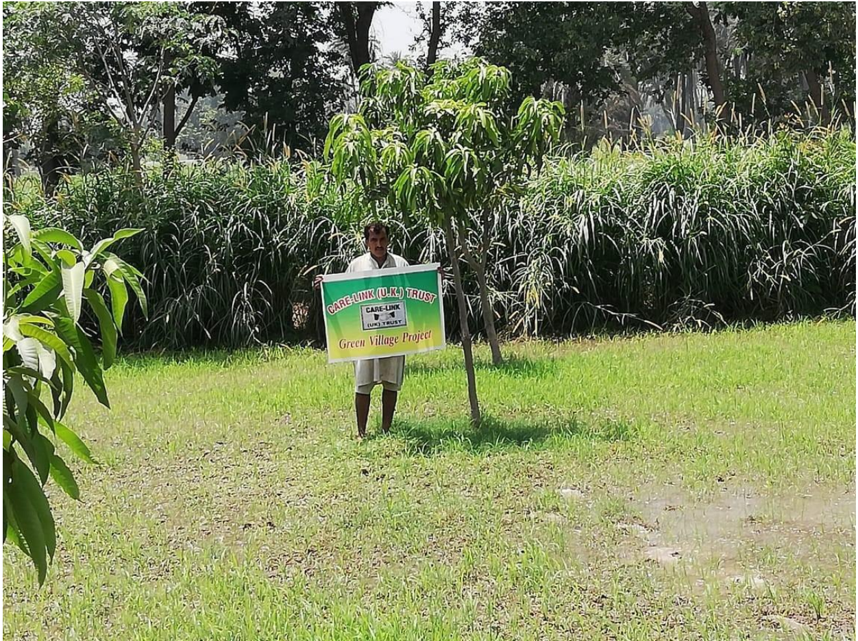
Figure17: Trees of mangoes, Dates and Blueberries- Environmental development- fruits produced are to be shared with poor people