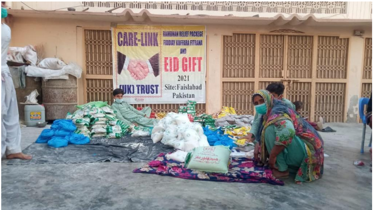
Figure 14: Eid Gifts for poor people in Faisalabad