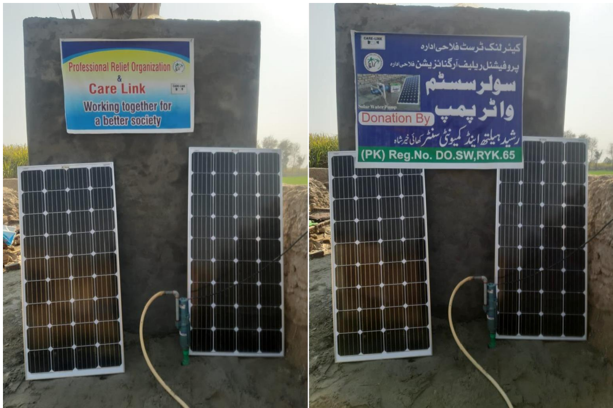
Figure 7: Solar water pump in Rahim Yar Khan, Pakistan