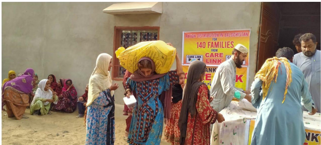
Figure 4: Food distribution to 140 families in Balochistan, Pakistan