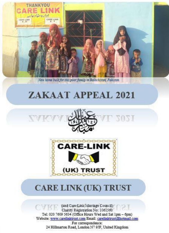
Zakat appeal leaflet posted to Donors in 2021

I am enclosing a cheque for the amount as under: