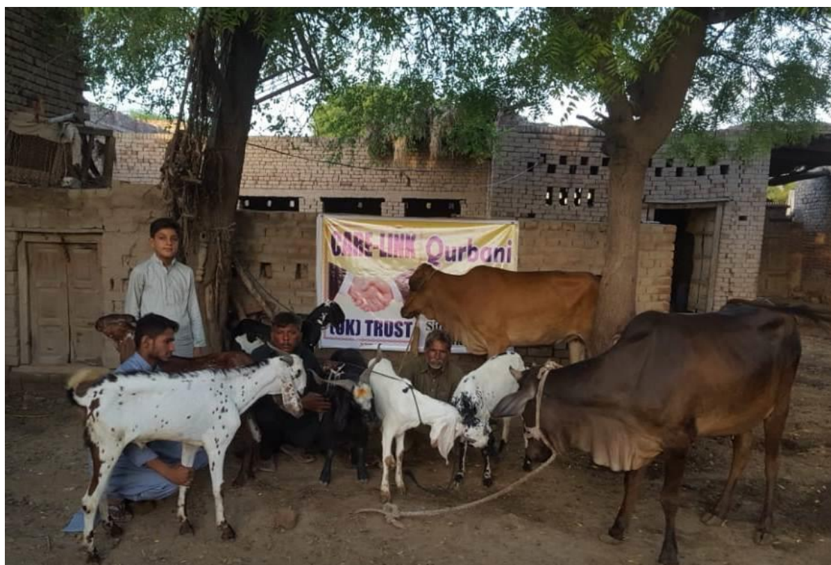
Qurbani animals in Punjab Pakistan.

In the month of Eid- ul- Adha, Muslims have an obligation to make sacrifice of an animal (per head). Since 2010, when people were facing the floods disaster in Pakistan, hundreds of people donated to Care-Link (UK) Trust for their Qurbanis animals (ritual animal sacrifice). Therefore, many hundreds of animals were offered as sacrifice on behalf of our generous donors, hygienically and speedily, we distributed fresh Qurbani meat in packaging of two Kilo Grams to poor families in disaster areas in a very systematic and organised manner.