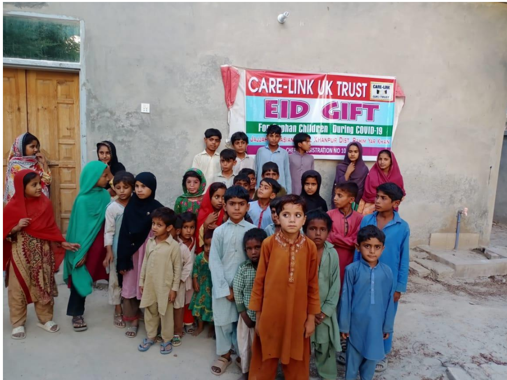
Distribution of Eid gifts for Orphan Children