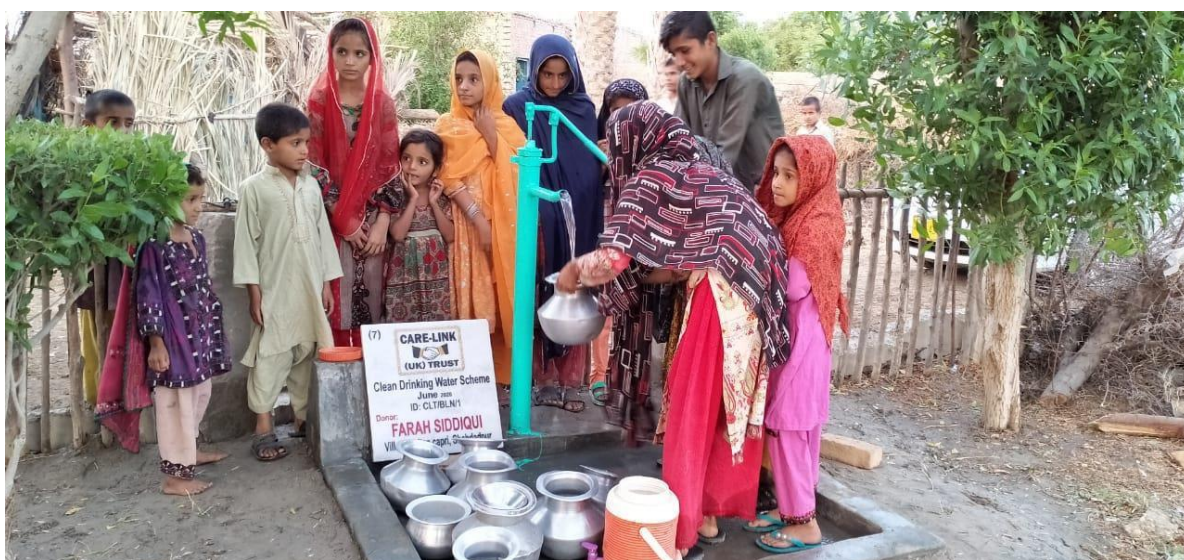
A newly installed water hand pump for a poor family.

As you can see in the photo, our water pumps are producing clean water as they have been installed using plastic pipe filter for underground and galvanised steel metal for human interaction. They are clean and durable as well.