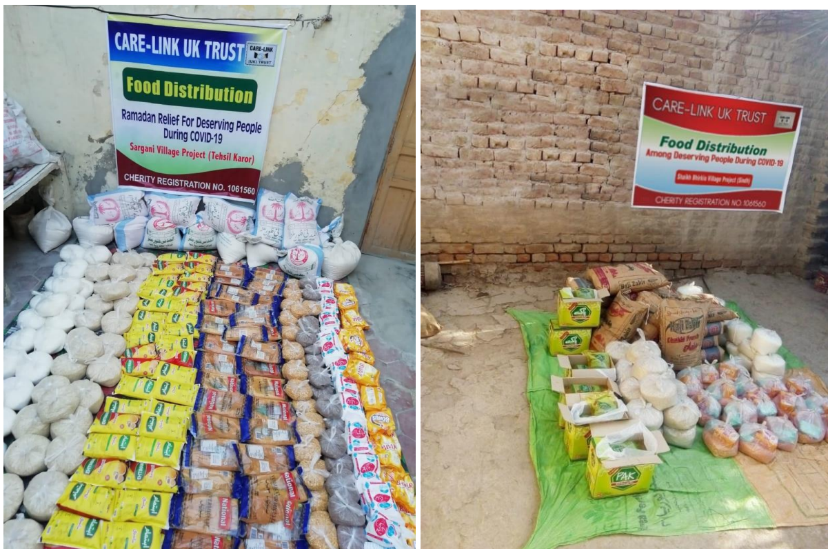
Food Distribution project in Sindh Pakistan

Care Link (UK) Trust support-teams very often get request from people, facing different kinds of problems, involving money matters. Depending upon the availability of funds Care Link Trust is always too glad to meet their demands/ requests, small or large. For example, we support (financially) poor young couples getting married, poor people who need help to repair/build their houses, poor people who need money for their medical treatment, poor people who need money for burial of their loved ones, provide financial assistance to widows (with or without children), and also poor old families- this all depend upon availability of funds.