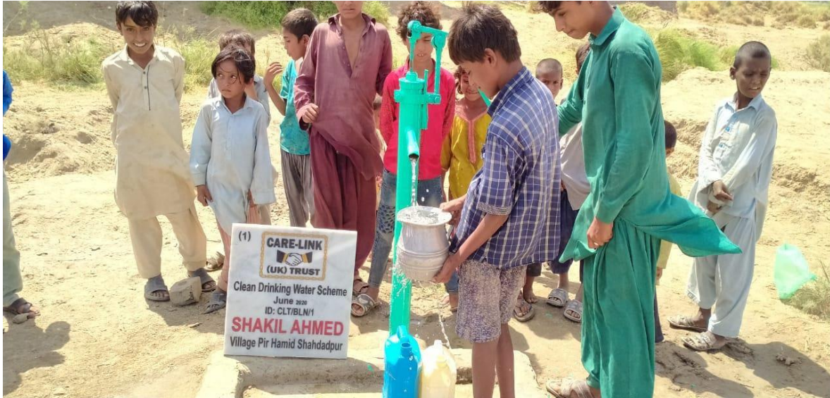
A newly installed water pump for deserving community

We have so far installed 9 water Tube wells and water filter plants. The water situation has improved in the targeted areas especially provision of water for animals and vegetation alike, Representatives of Care Link are getting more requests for water pumps for areas where weather is hot and people are facing problem of finding fresh water.