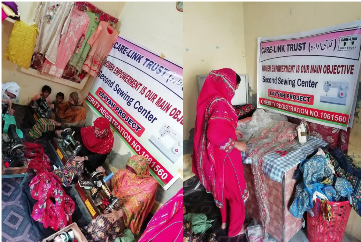
Sewing Centre project