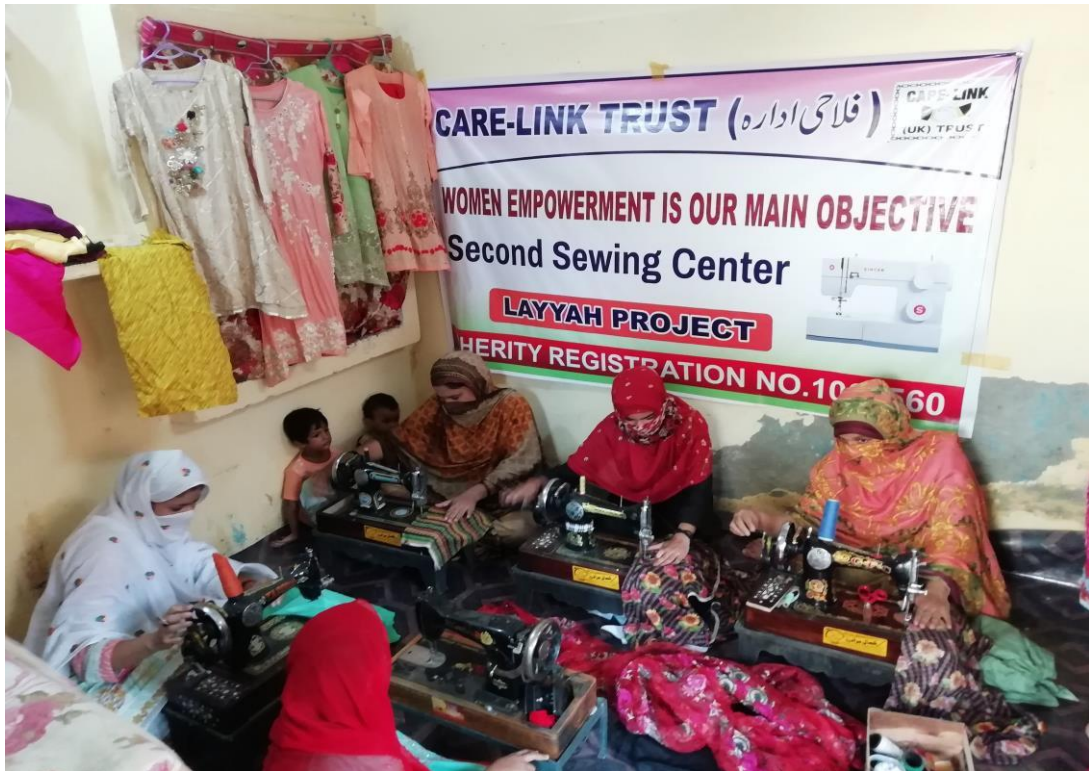
Sewing project 2020 Layyah, Punjab, Pakistan