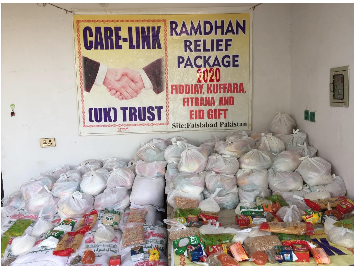
Food Distribution in Faisalabad, Pakistan.