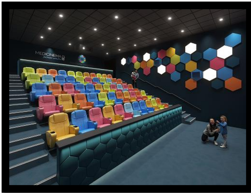
Visualisation of proposed MediCinema design at Manchester Royal Infirmary

Alongside this success, we continued to explore other potential sites, with a particular focus on those key NHS regions currently without a MediCinema. Consequently, in October we were delighted to announce a new MediCinema in partnership with Manchester University Hospitals Foundation Trust. This will see the conversion of a lecture theatre to a MediCinema situated centrally at the Oxford Road Campus, and able to serve patients and their families at Royal Manchester Children’s Hospital, Manchester Royal Infirmary and the other hospitals based at this site. The service will be supported by a partnership with Manchester Foundation Trust Charity. We expect to announce our build timing early in 2025.