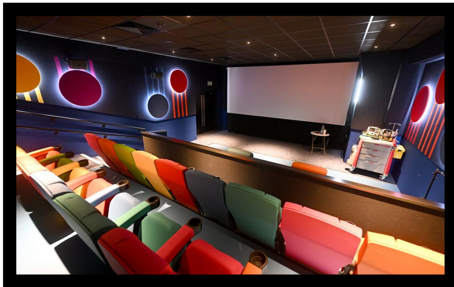
The new MediCinema at Alder Hey Children's Hospital

The summer of 2024 saw us break ground at Alder Hey Children's Hospital in Liverpool, and in November we were immensely proud that one of the children being treated at the hospital, along with her family, was able to clap the clapperboard to celebrate the first screening. It was none other than an exclusive preview of Walt Disney Animation Studios' musical Moana 2 . MediCinema's new partnership with the Alder Hey Children's NHS Foundation Trust and their charity enables us to deliver an additional 5000 patient and family experiences annually. And for the first time, MediCinema will be serving patients in the North West of England, based at the heart of a prestigious nationally important centre of care.