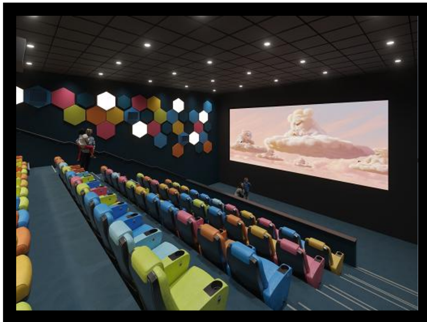
Visualisation of proposed MediCinema design, Manchester Royal Infirmary

MediCinema formed a new partnership with Paramount Global alongside the Manchester University NHS Foundation Trust (MFT) and its own charity, Manchester Foundation Trust Charity to kickstart the conversion of an existing lecture theatre inside the Manchester Royal Infirmary into a state-of-the-art cinema.